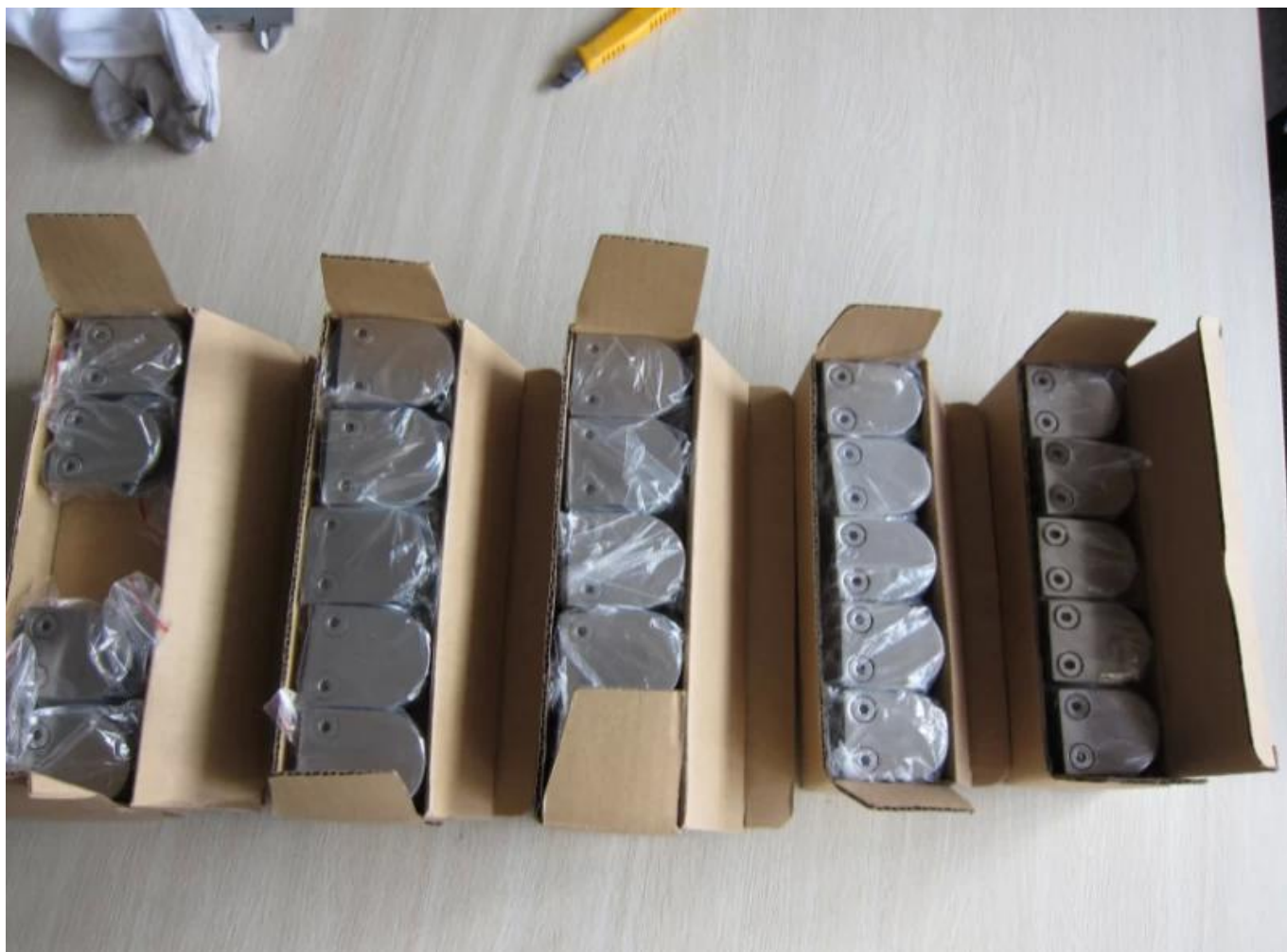
Producción en masa