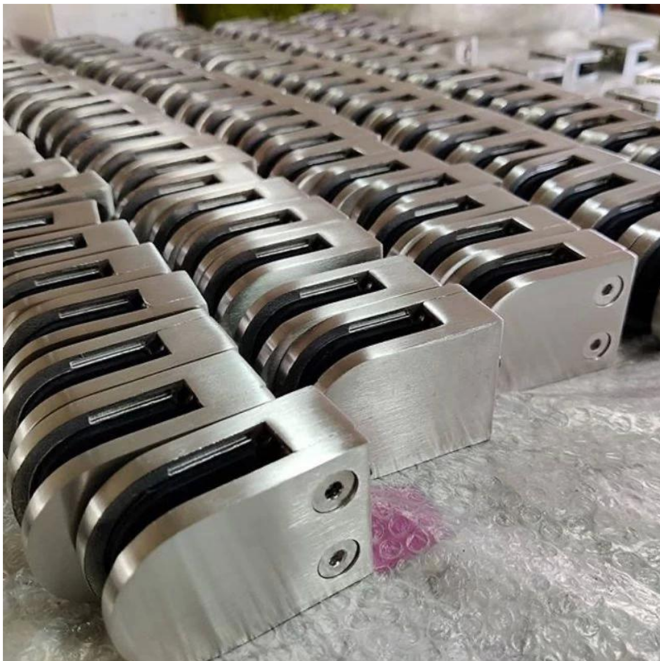
Imagen del proyecto