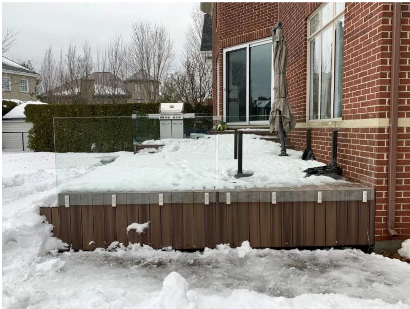
Otros tipos de abrazadera de vidrio