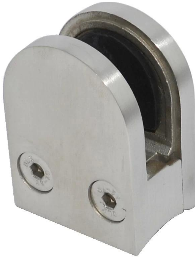
Retención lado abrazadera de cristal placa de vidrio pendiente