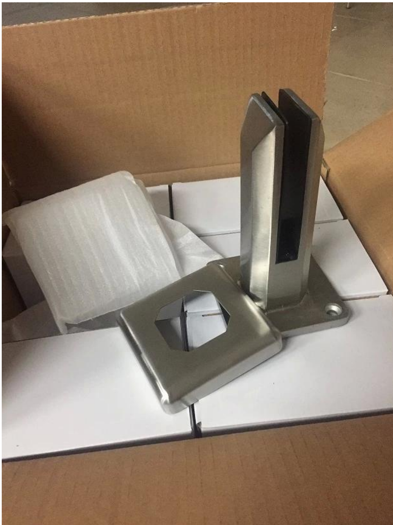
Foto de instalación