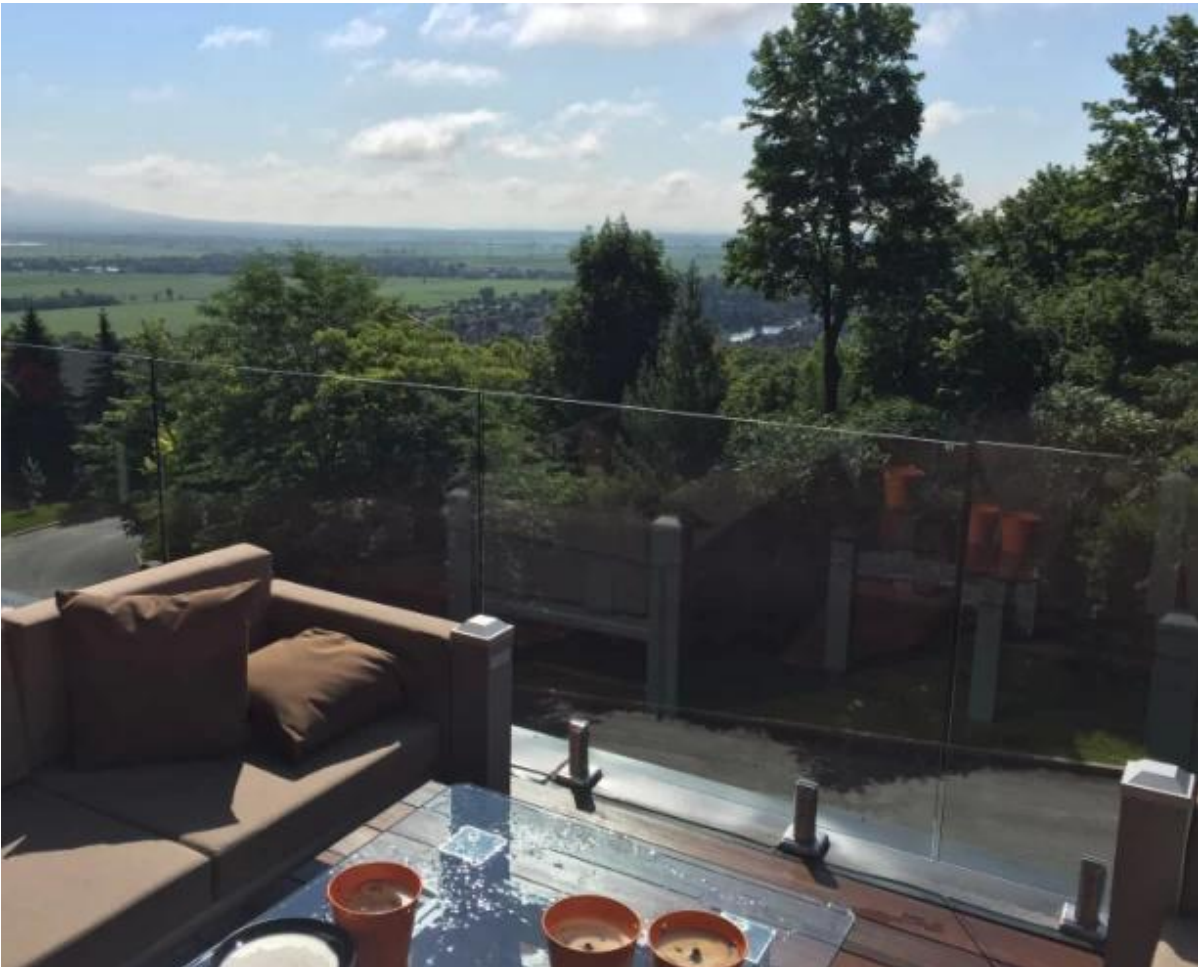
Shenzhen Launch Co, Ltd on ammattimainen valmistus suunnitteluun, tuotantoon ja myyntiin ruostumattomasta teräksestä valmistettujen laitteiden, lasikaiteen varusteet, kaide