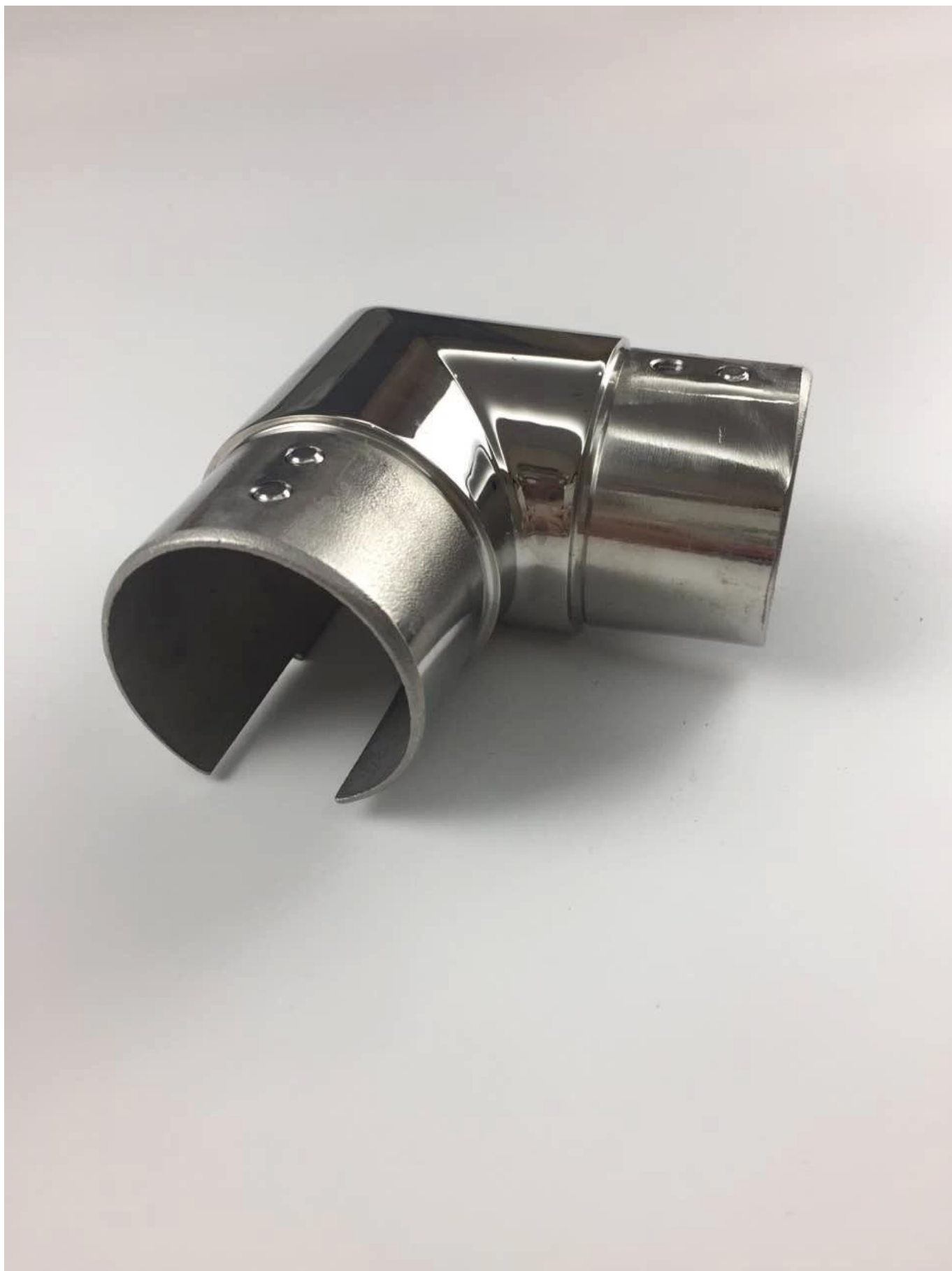
embout pour tube de main courante, vue de côté