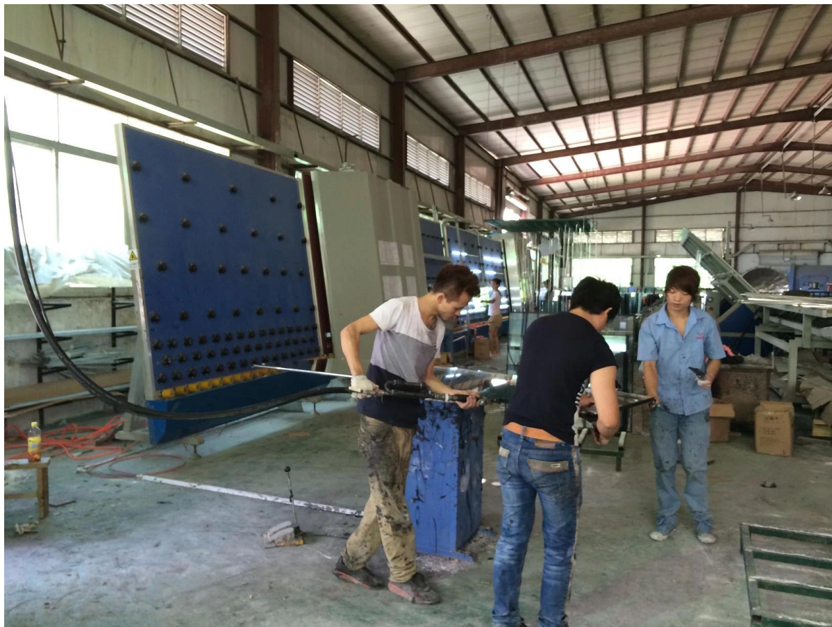
Packaging & Livraison