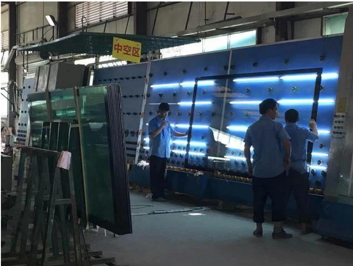
Gamme de produits