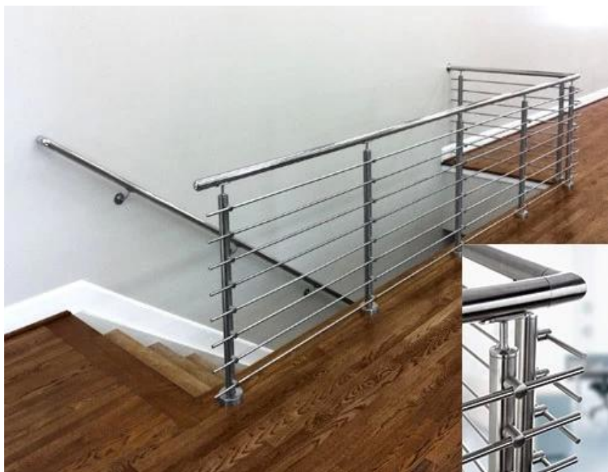
Poteau de balustrade à barre transversale de conception supérieure / latérale: