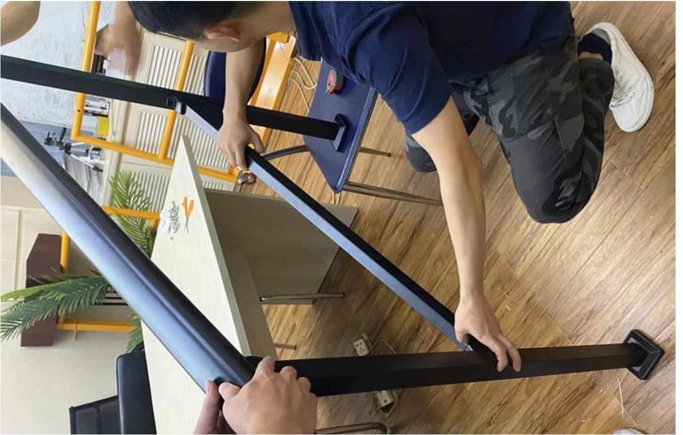
Photos de la production de masse d'un poteau en acier galvanisé pour la main courante