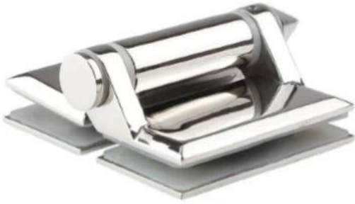
Glass to glass hinge