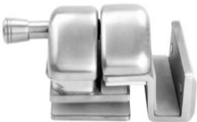
Glass to glass latch 90 degree