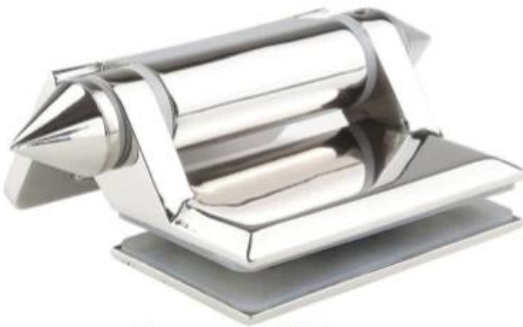
Glass to wall hinge