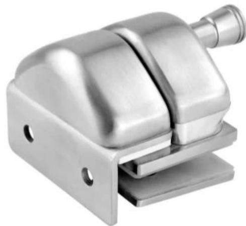
Glass to wall/square post latch