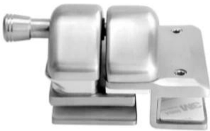
Glass to glass latch 180 degree