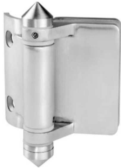
Glass to round post hinge