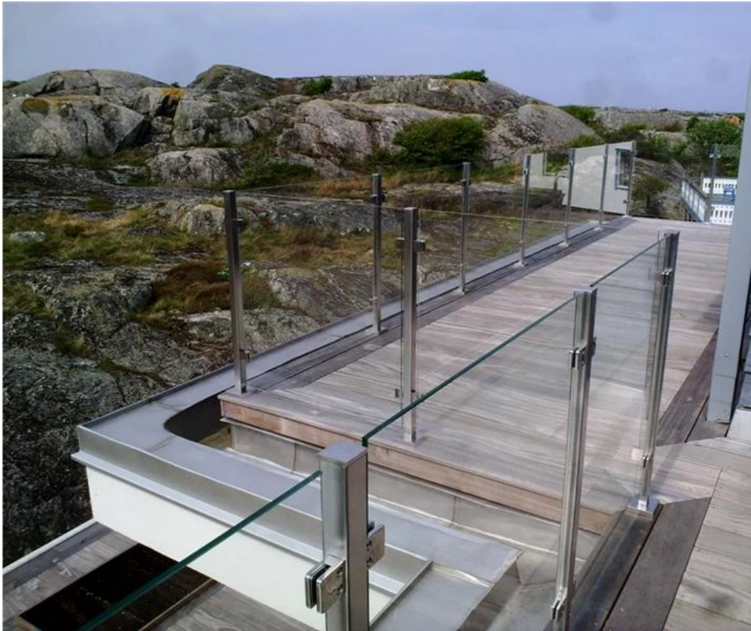
Conception de balustrade d'acier inoxydable de support de verre carré de 50x50 pour la clôture de piscine: