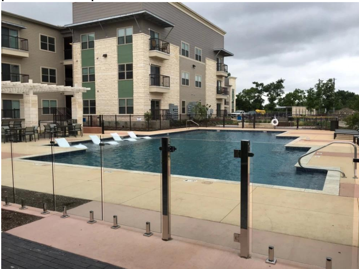
Poteau carré de 80x80mm en acier inoxydable avec la conception de balustrade pour la balustrade en verre sûre commerciale