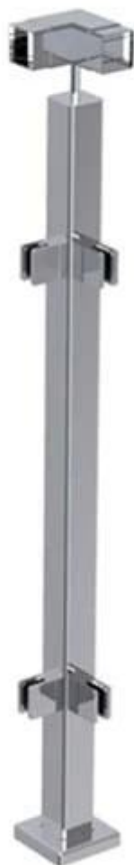
Balustrade d'acier inoxydable de support en verre pour la conception moderne d'escalier