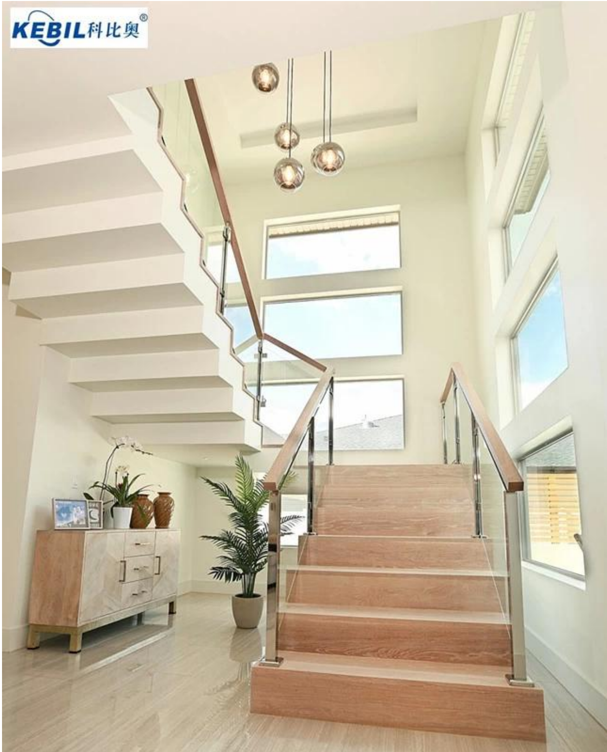
Conception de balustrade d'acier inoxydable de support de verre carré de 50x50 pour la balustrade de plate-forme: