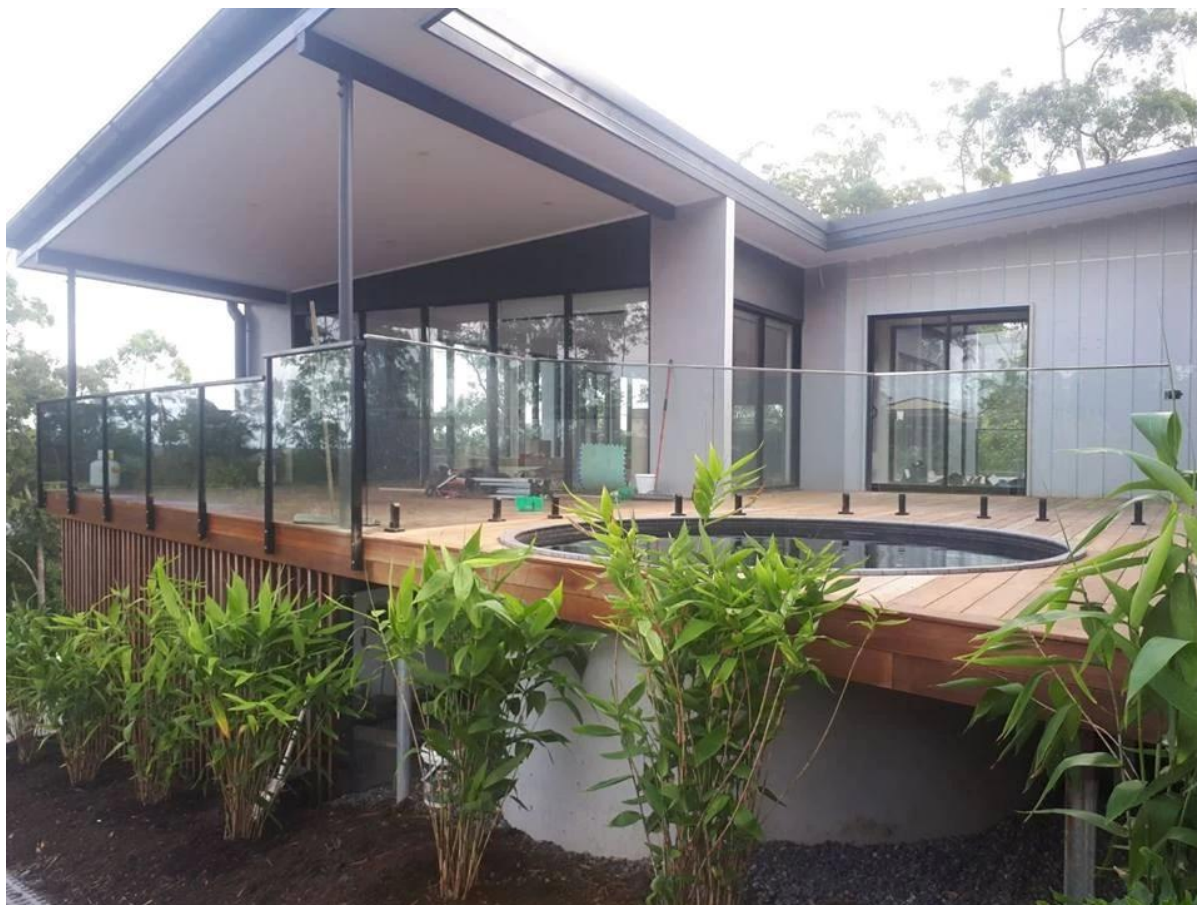
Satin brossé Clôture en verre en acier inoxydable de pince de piscine de pince de clôture en acier inoxydable SBM-3: