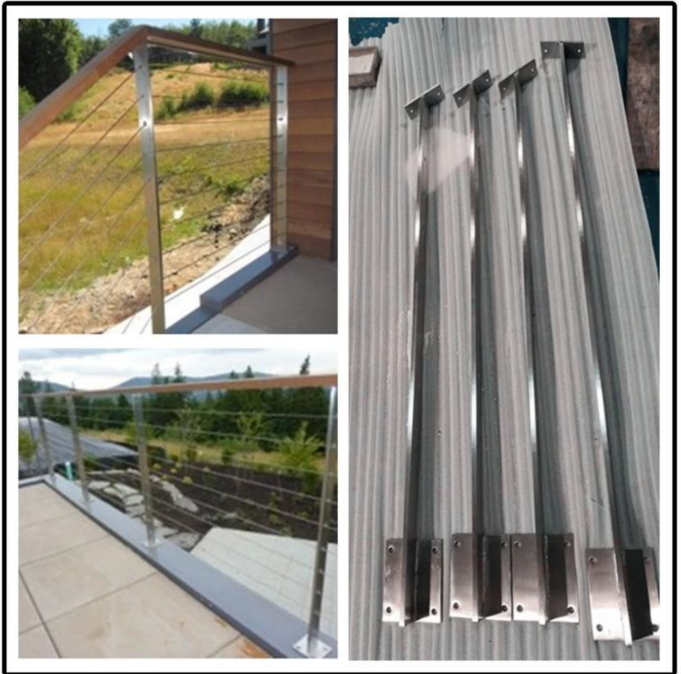
Modèles de garde-corps en acier inoxydable à double barre plate: