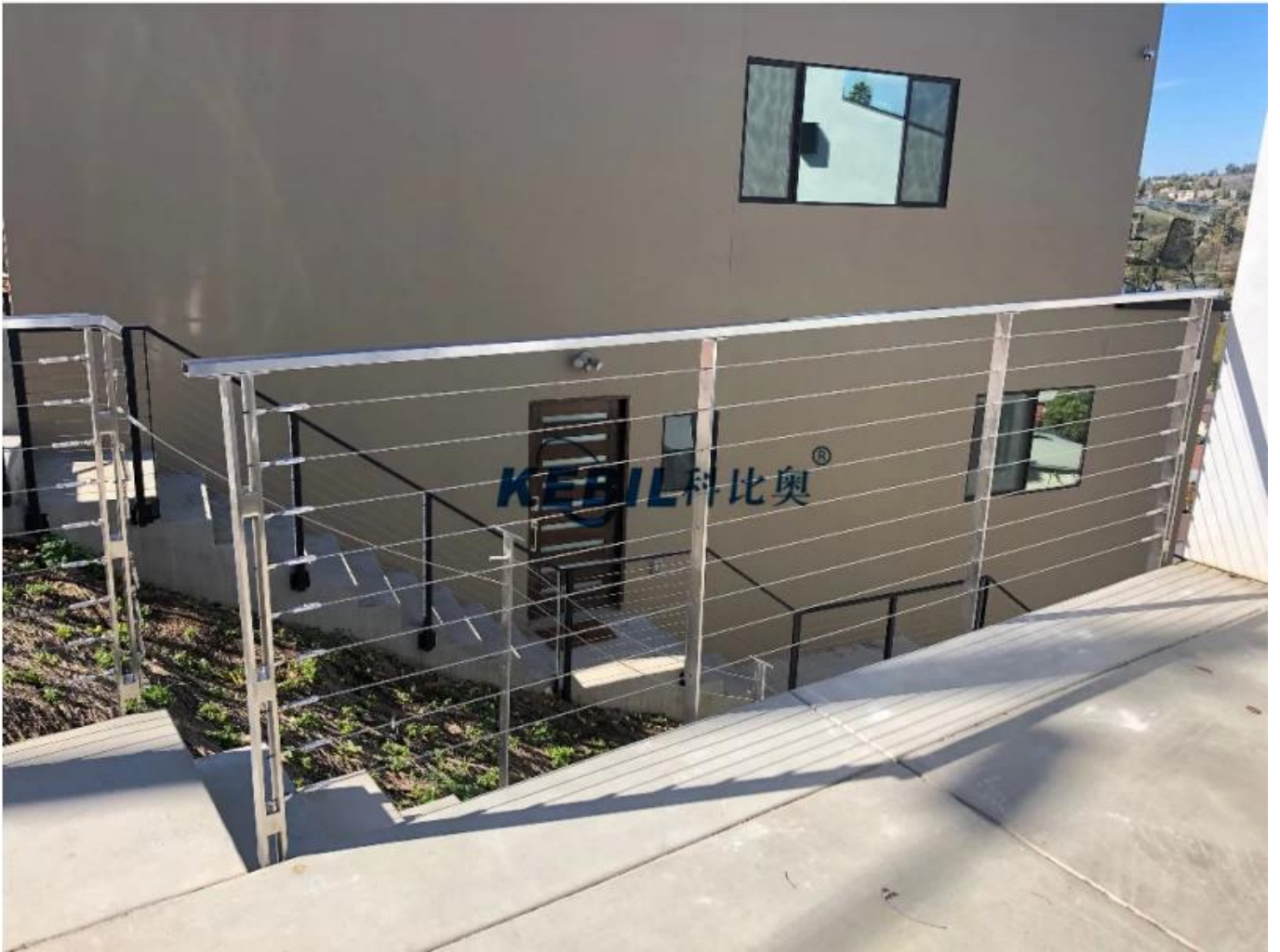
Round & Balustrade carrée en acier inoxydable de type poteau de balustre: