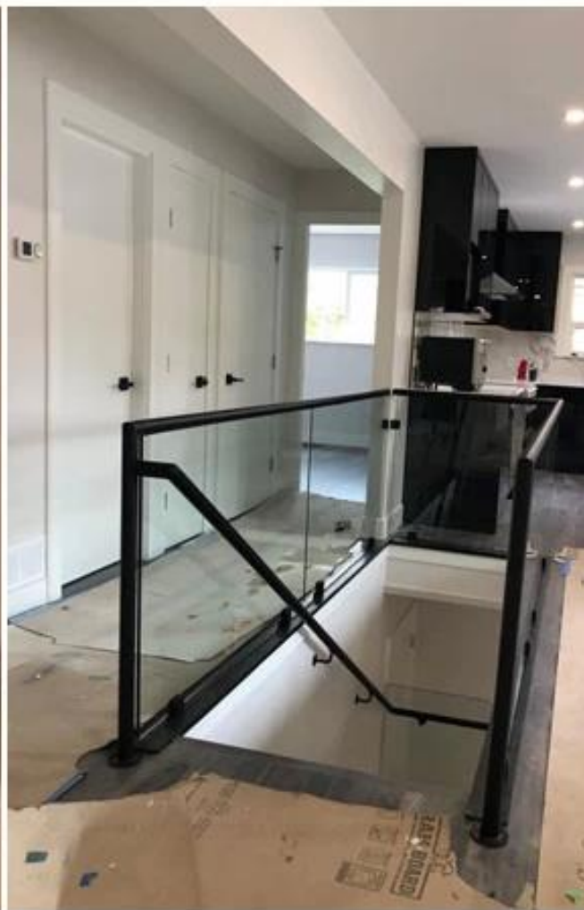
Photos du projet d'entretoise en verre