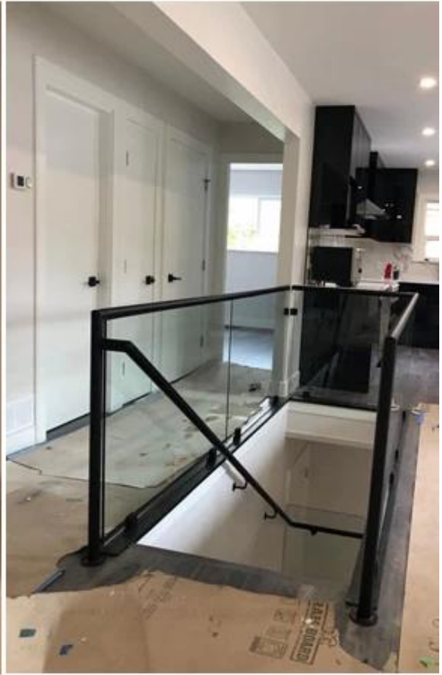
Photos du projet d'entretoise en verre