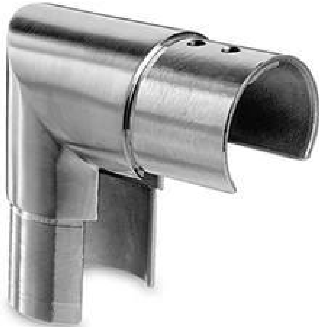
Coude à fentes