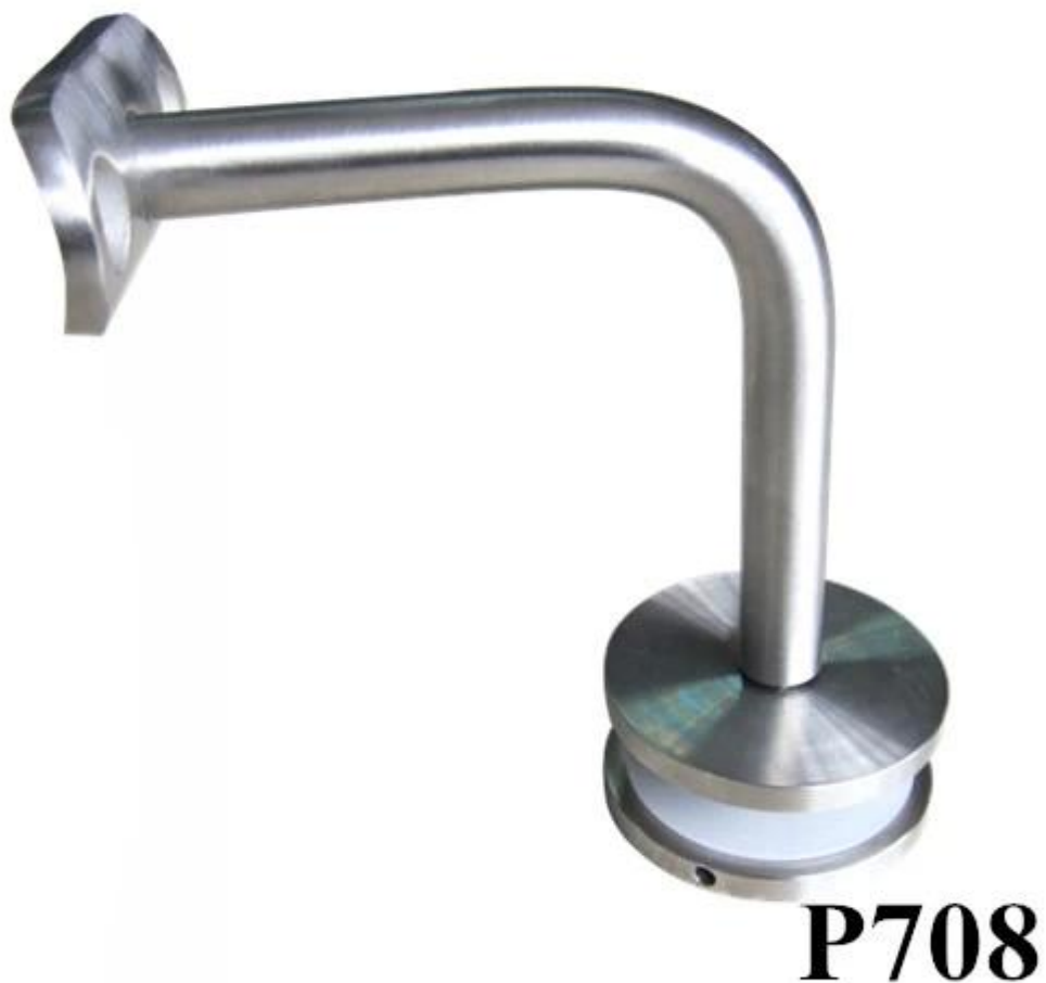
Foto di staffa per corrimano in vetro -