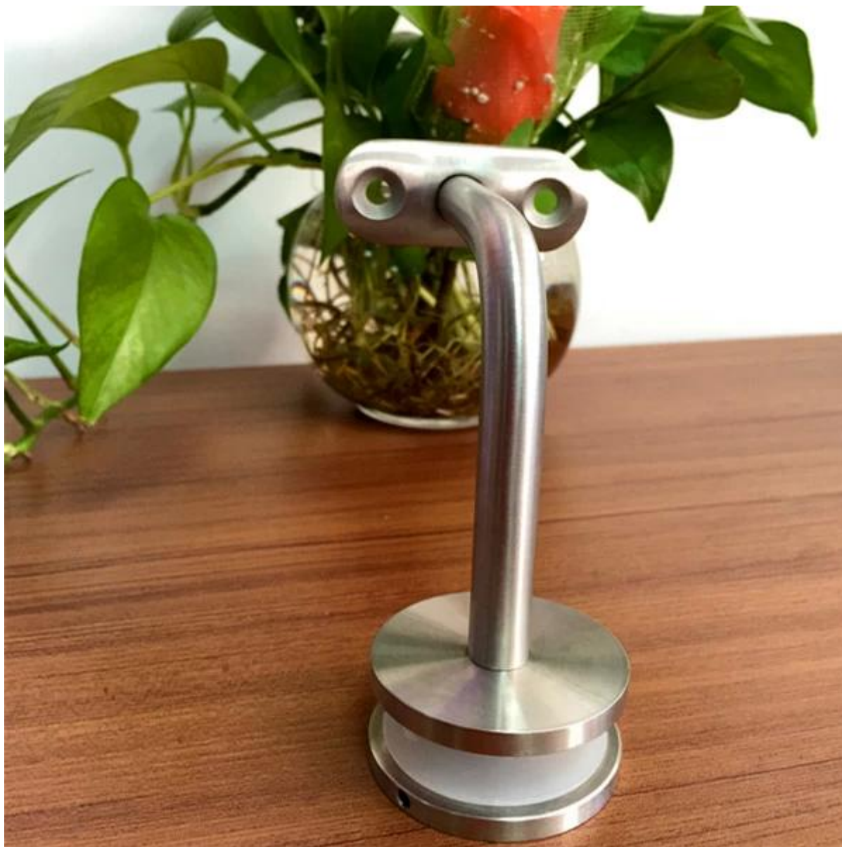
Foto del progetto della staffa per corrimano in vetro -