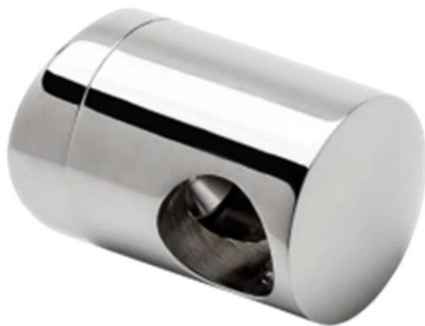
Foto del progetto di supporti per barre da 12 mm in acciaio inossidabile 316-