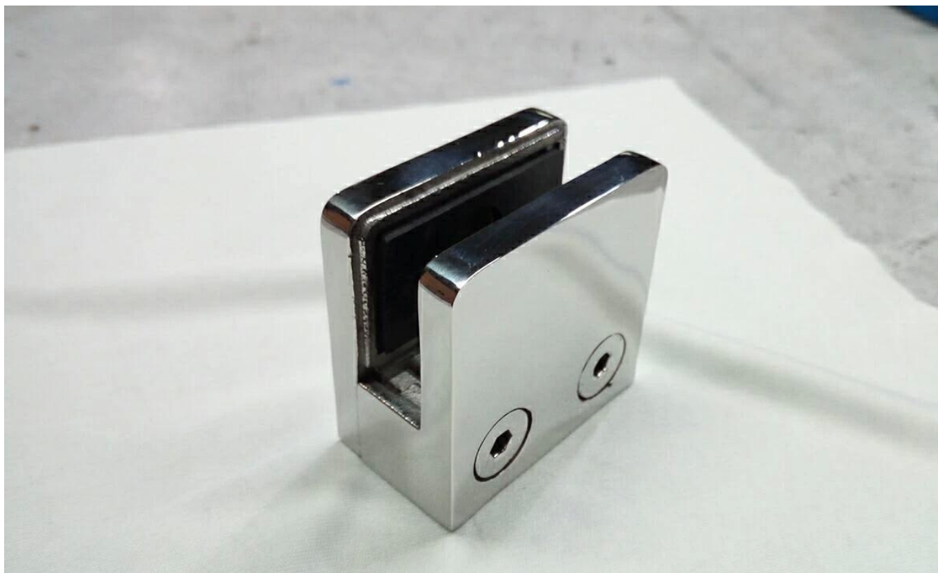
Installazione di morsetti di vetro-