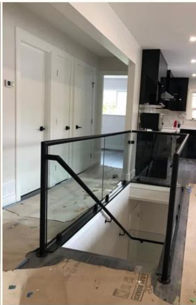
Foto di progetto di vetro di stallo