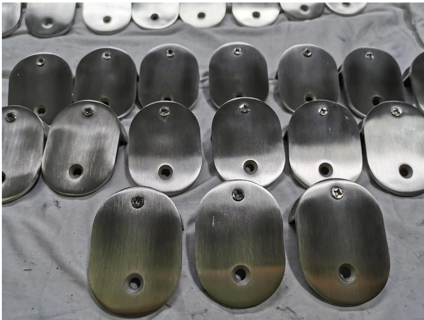
- Foto del progetto del vetro a 180 gradi al morsetto a parete CB-180