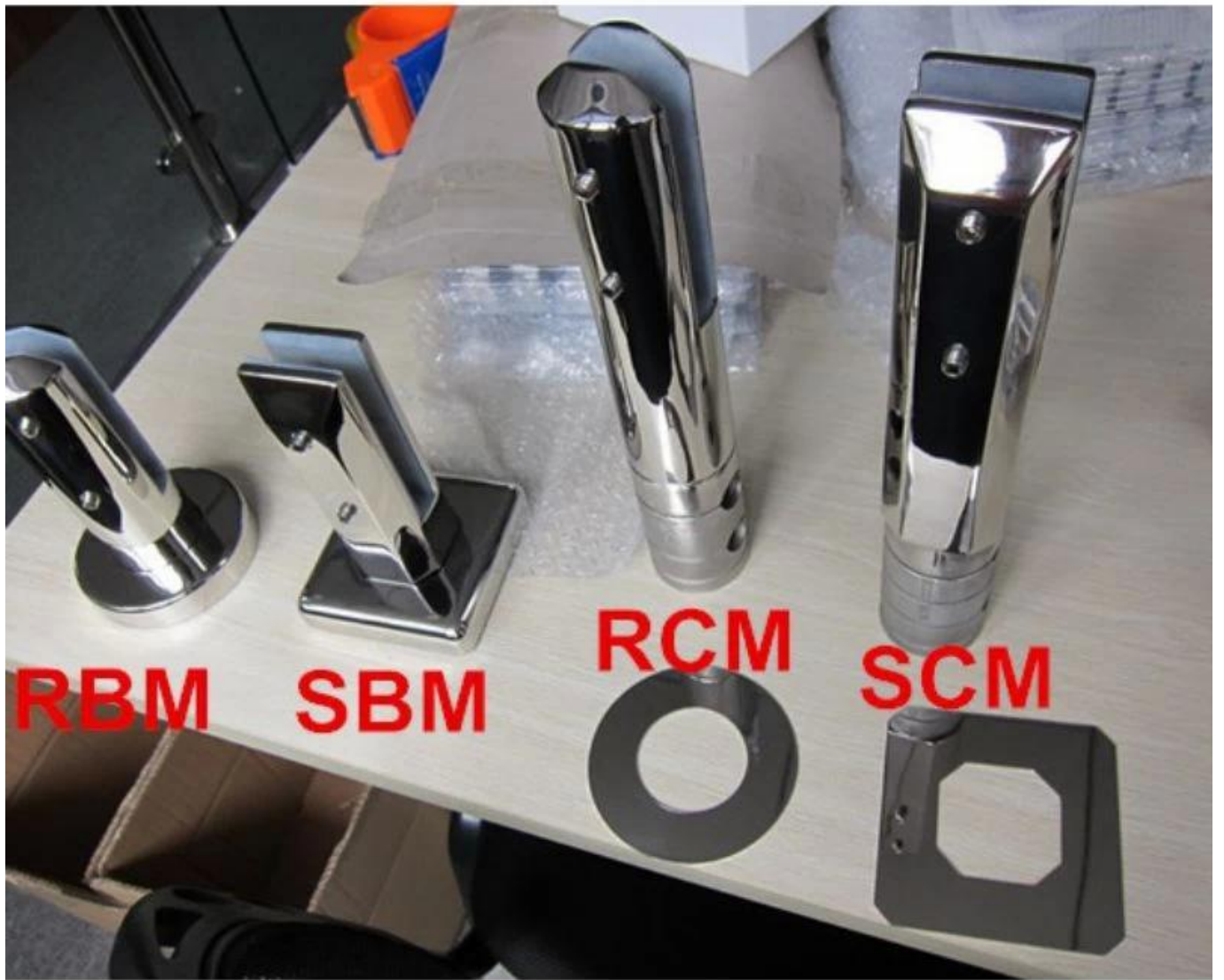
Finitura superficiale satinata