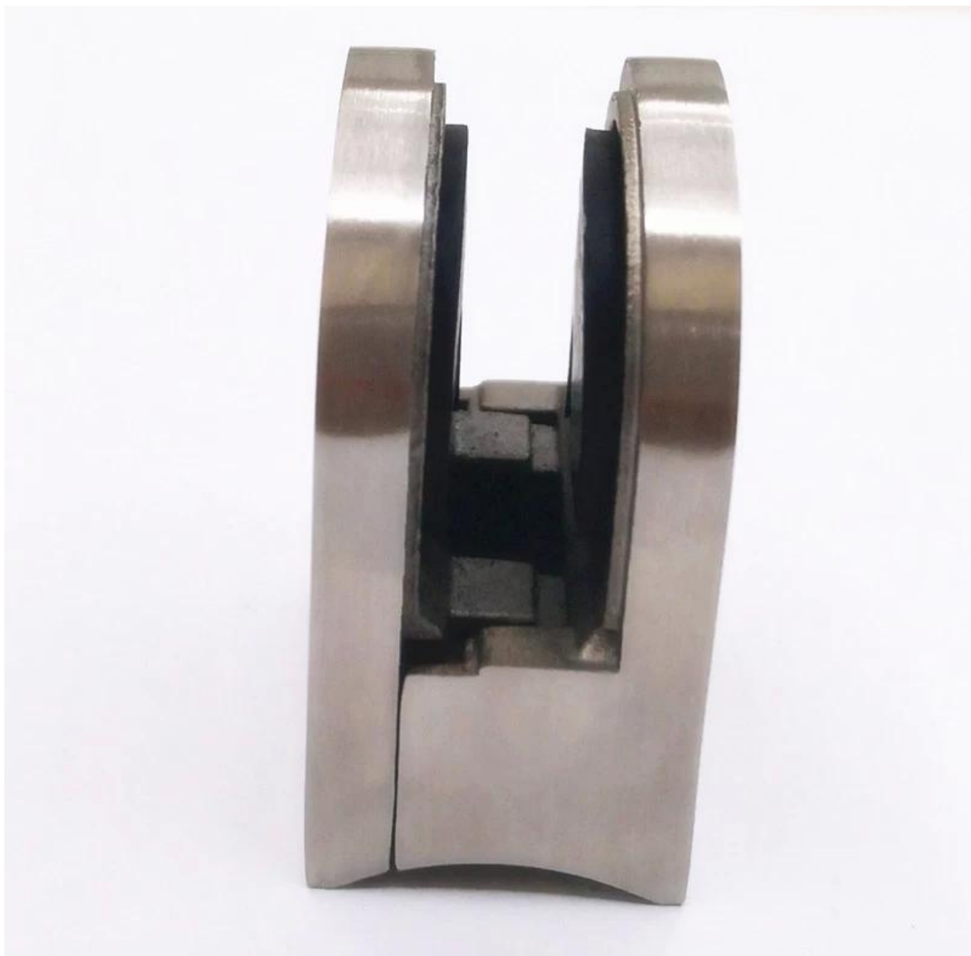
Installazione di fascette di vetro su sistemi di montanti in vetro-