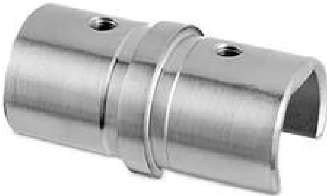
Tappo a taglio scanalato