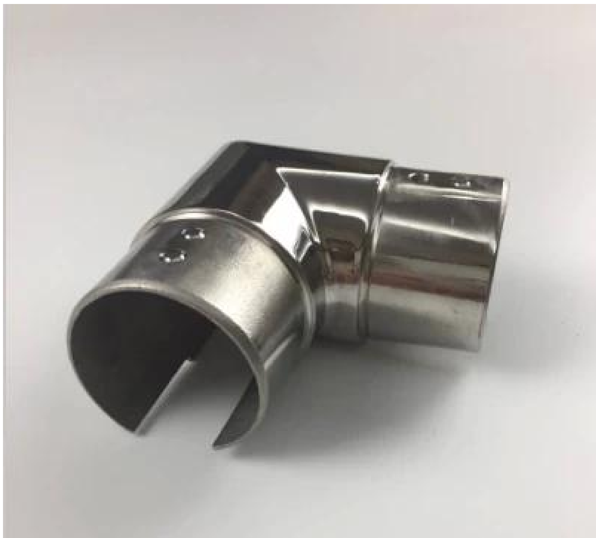
Connettore a tubo scanalato