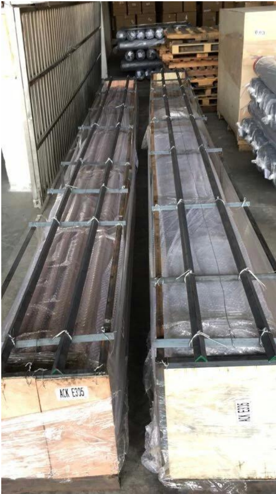
4. Project foto's voor 21x25mm roestvrij stalen slang leuning en toebehoren