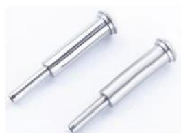
T807- 3mm/4mm cable