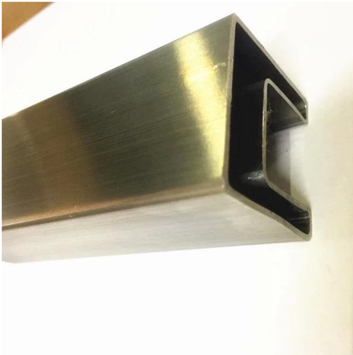
# 5. 20 x 25 x 1,2 mm, 14 x 14 mm buis met enkele sleuf: