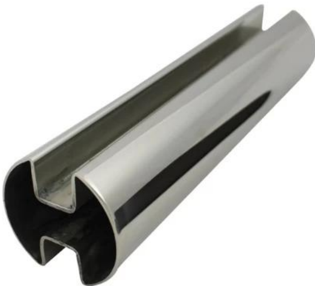
# 3 dubbele gleufpijp, 2-weg 90 graden: