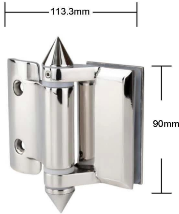
Part # G-R