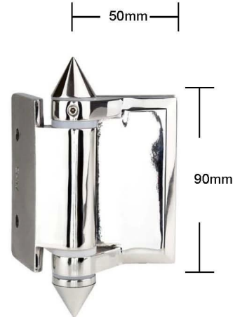
Part # G-W