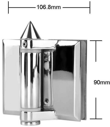
Part # G-G

Spring can be adjusted for closing speed control .