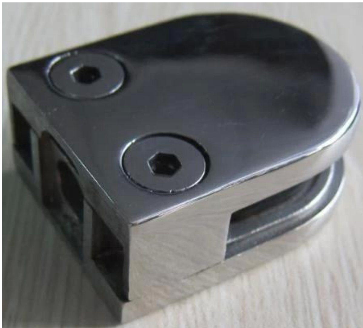
Radius rug (voor ronde paal)