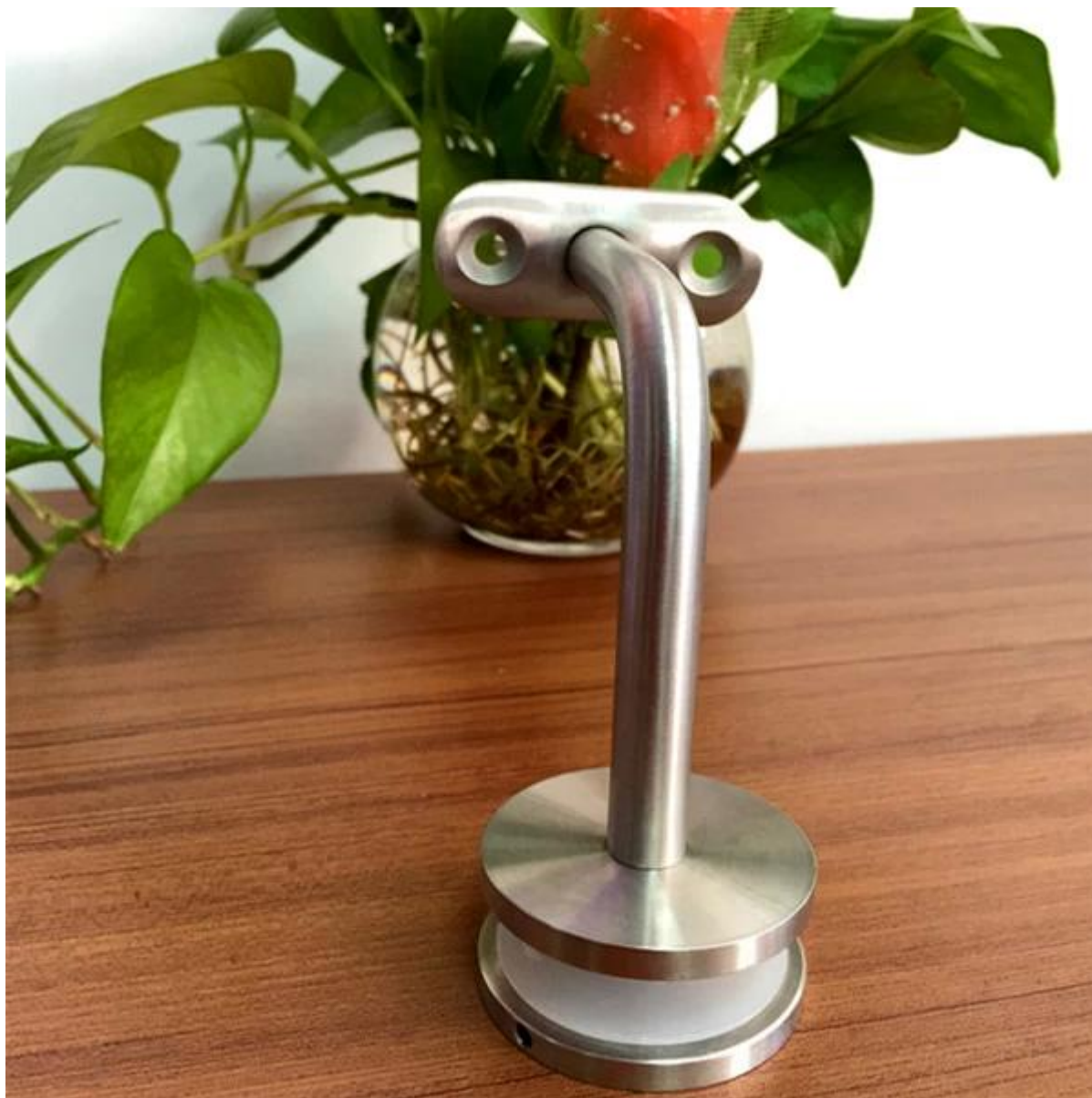
Zdjęcia projektu uchwytu poręczy ze szkła -