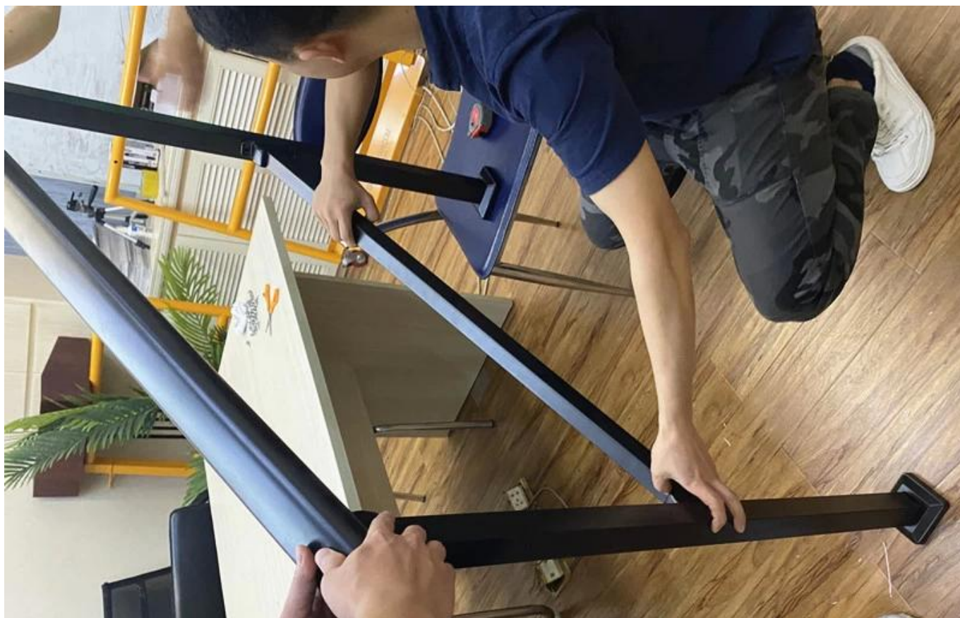
Mass Production Zdjęcia ocynkowanej stalowej słupku do poręczy schodowej