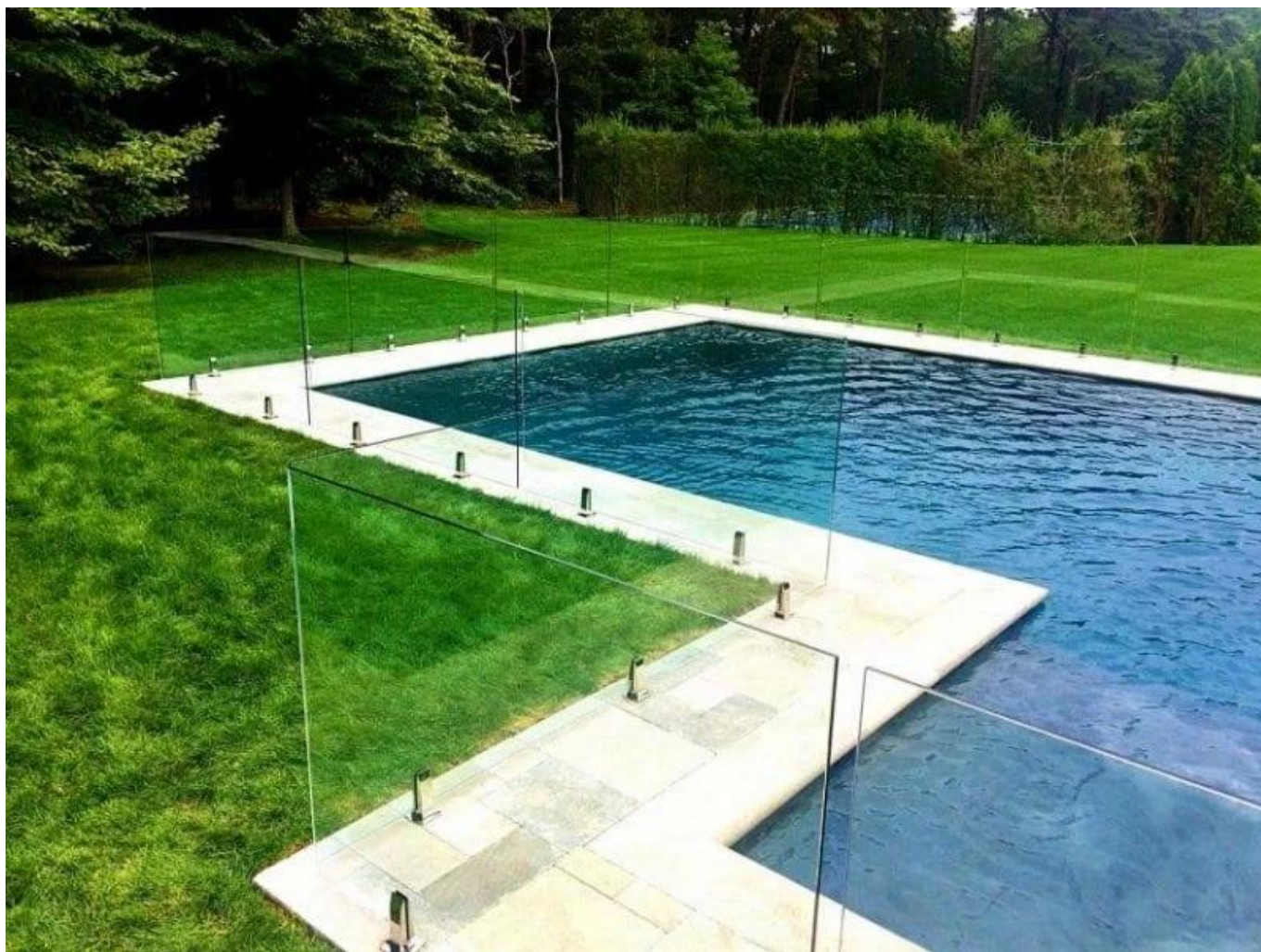
Bezramowy balkon szklany balustrada