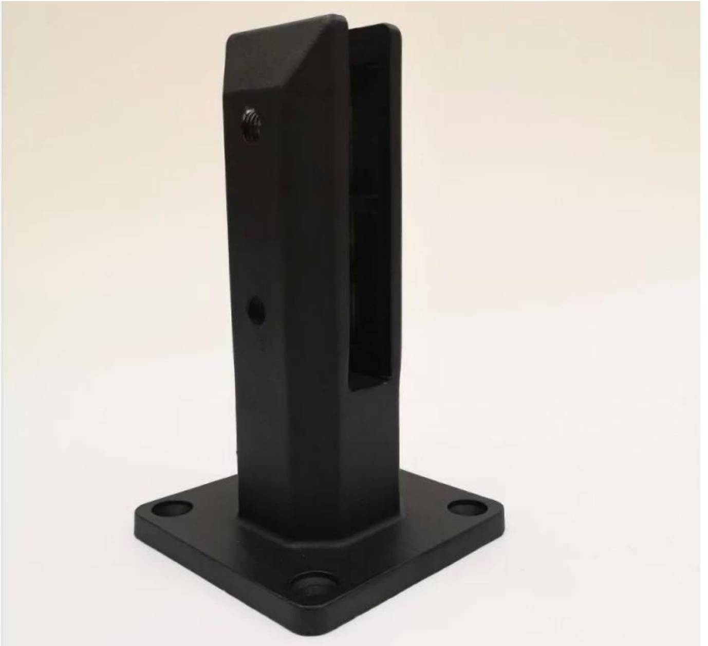
4, galwaniczna czarna powierzchnia