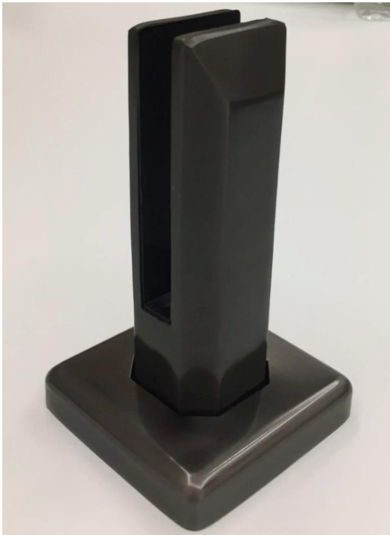
5, galwaniczna powierzchnia złota