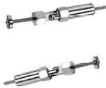
T802- 5mm/6mm cable