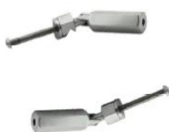
T801- 3mm/4mm cable