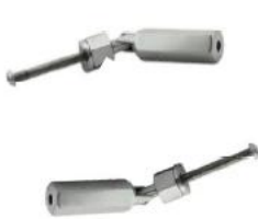
T801- 3mm/4mm cable

for 3mm, 4mm, 5mm or 6mm thickness cable