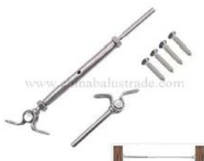
T806- 4mm cable