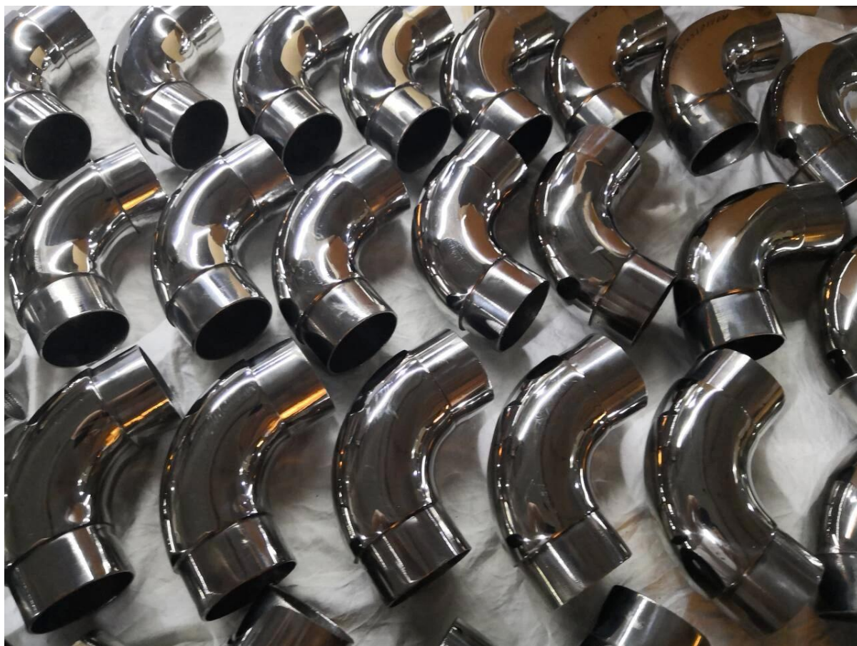
prosto kąt 90 stopień poręcz łokieć-