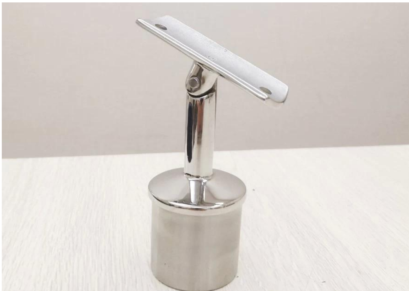
# Installation photos of stainless steel post handrail bracket