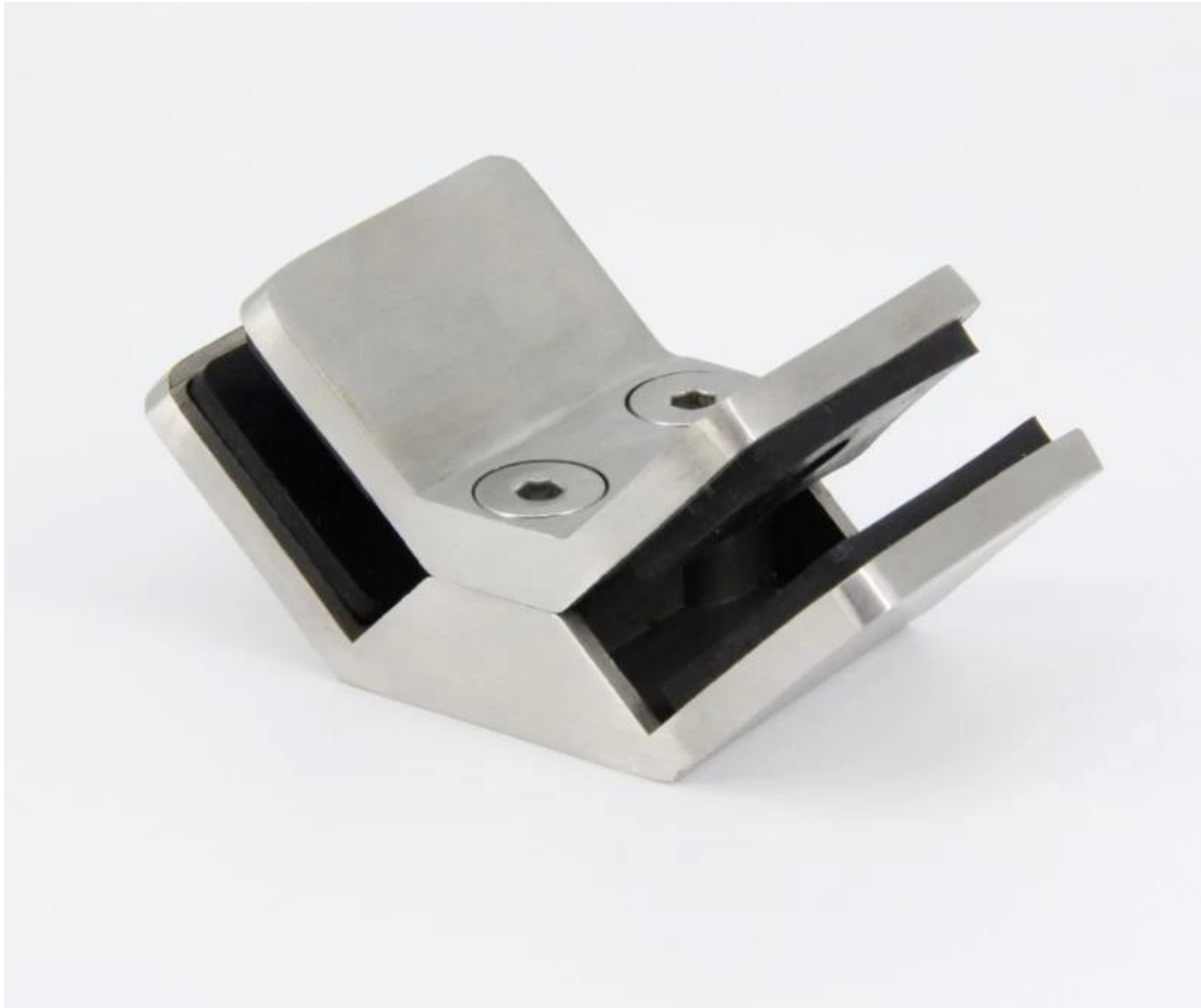
side view . of 90 degree stainless steel glass clamp