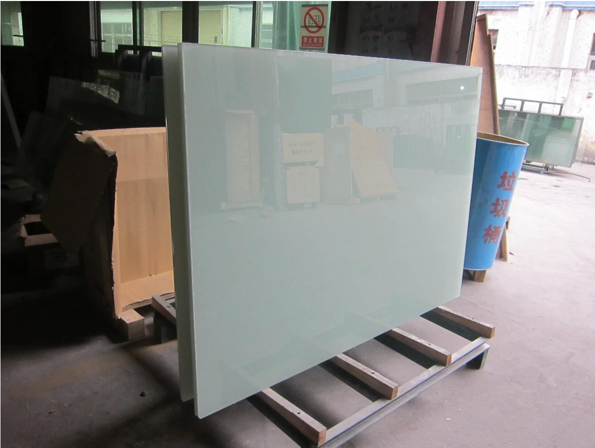
Glass package:\nFully wood box package with protective stuff;