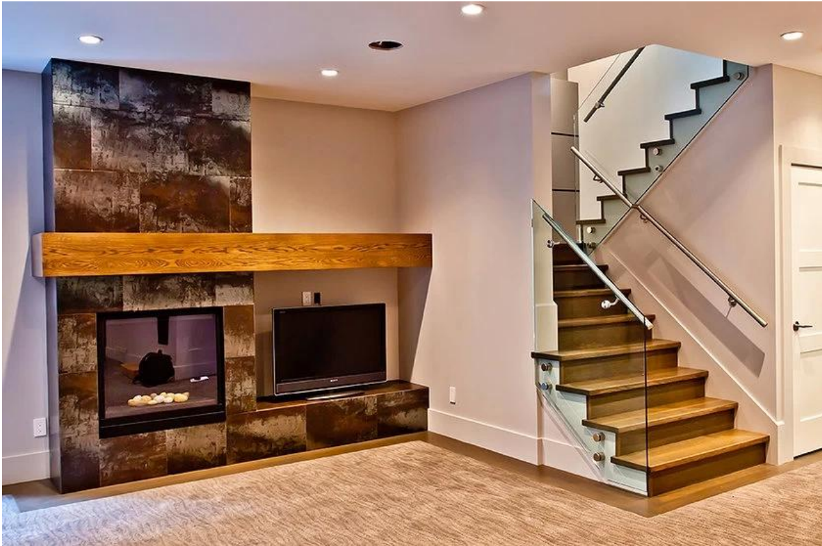
Standoff applied on swimming pool glass railings :