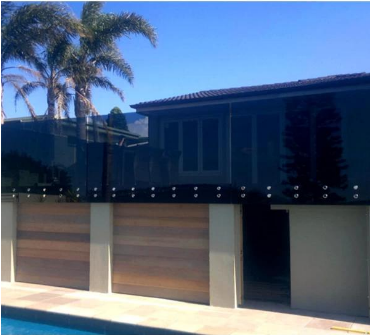
Standoff used on exterior staircases :