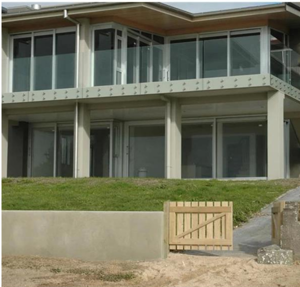
Standoff bracket used on wood balconies :