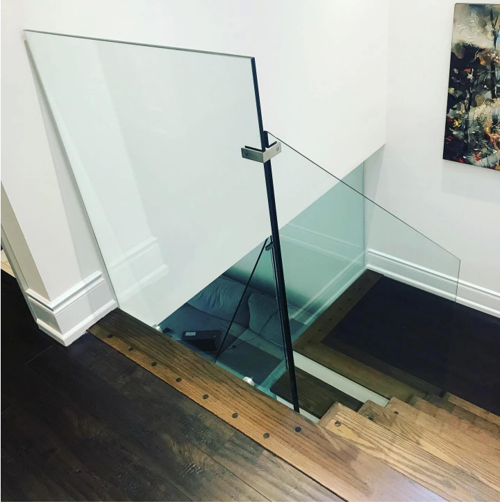
Matte Black Finish Glass Railing Clamps