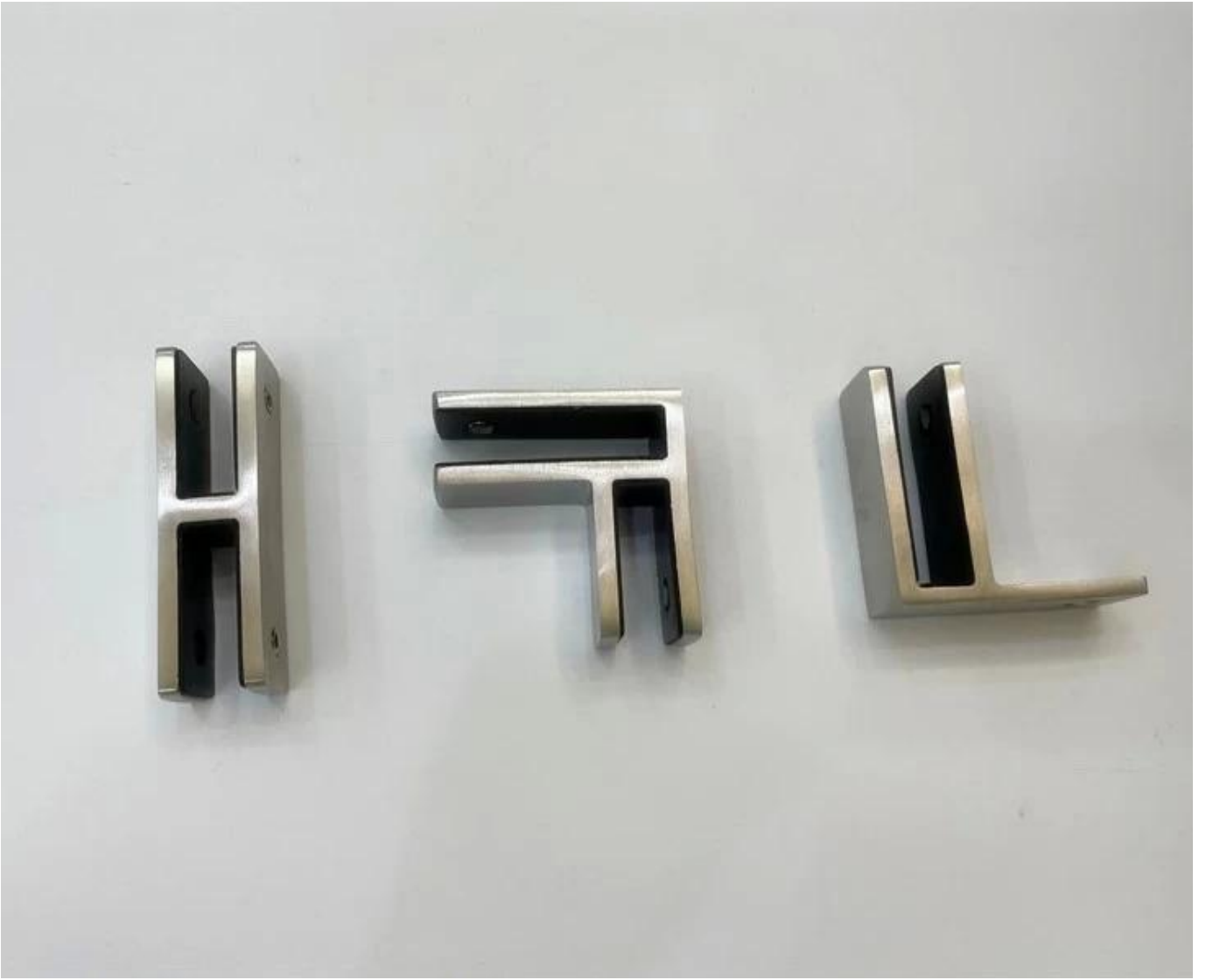
Adjustable degree glass clamp: