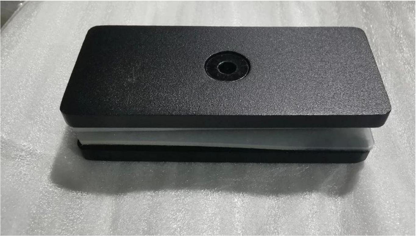
90 Degree Corner Glass Railing Clamp in Black: