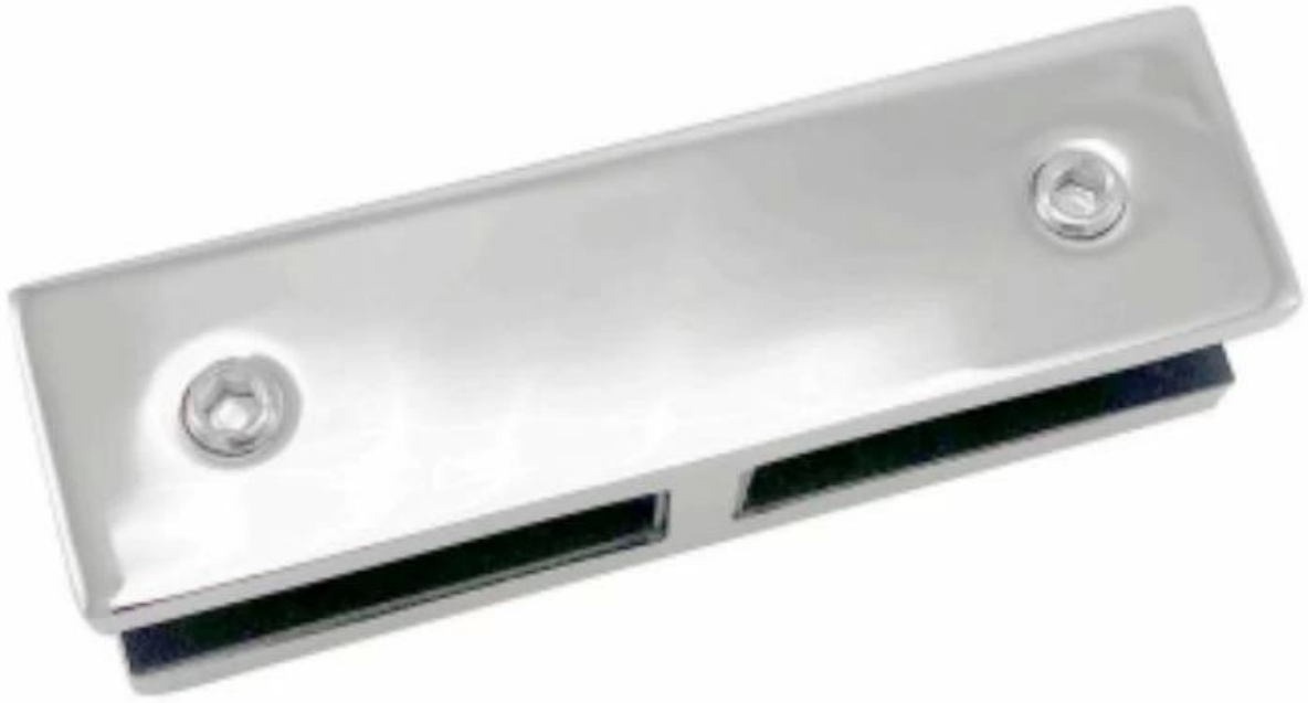
Small M8 screws with plastic end for the glass clamp