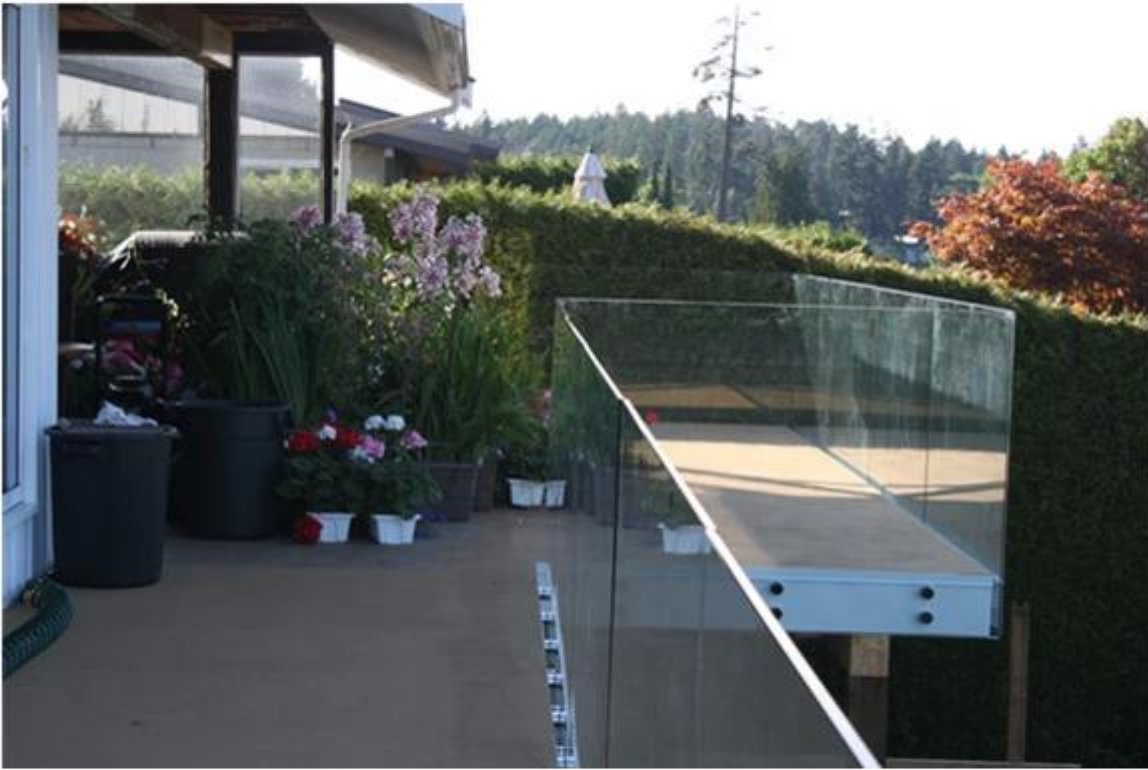
glass balustrade with standoff