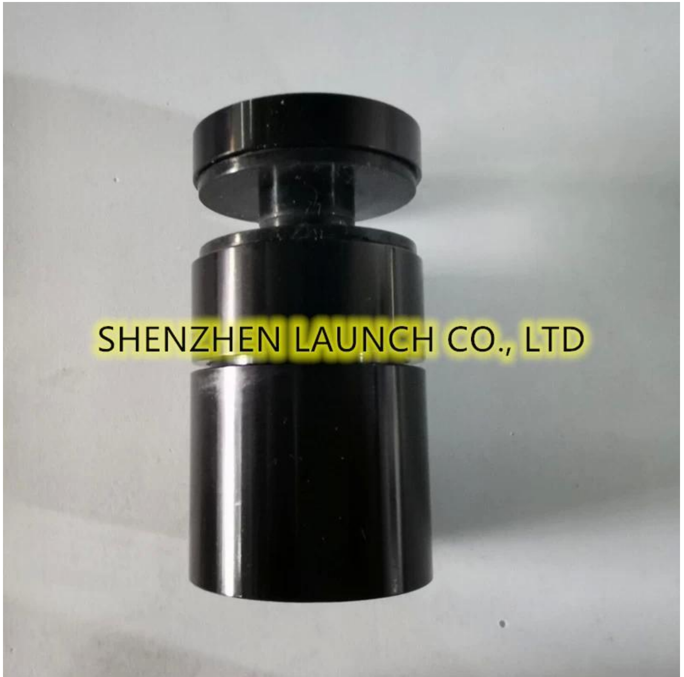
Machined finish of standoff bolt -