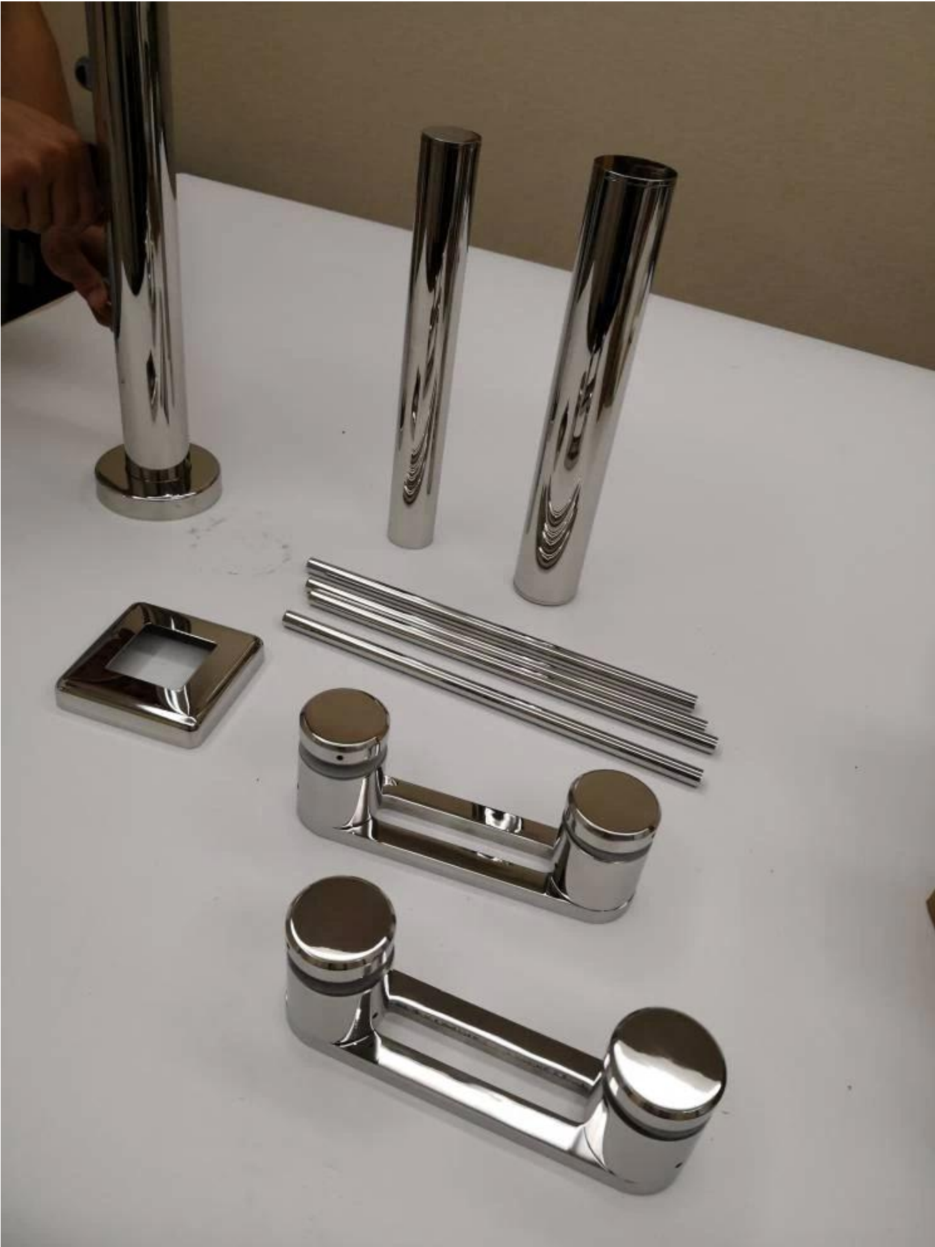
Production photos for standoff bolt-