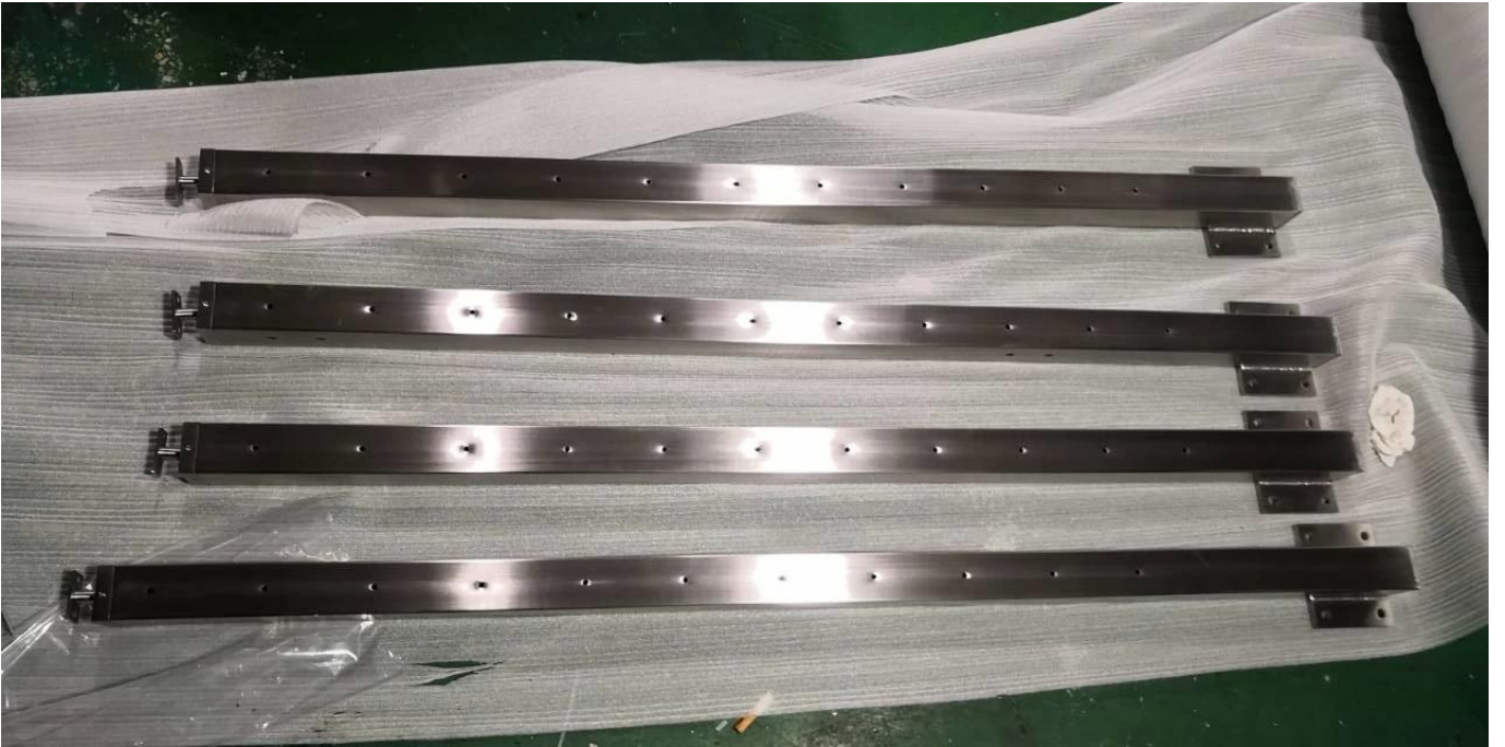
Top/Face Mount Balustrade Posts for Stainless Steel Cable Railing Systems: