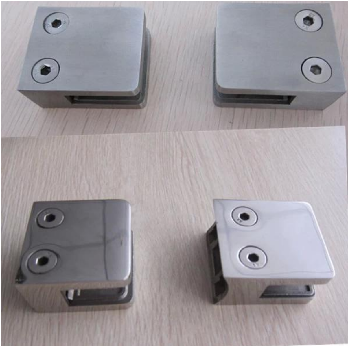
2. glass clip for 3/8" and 1/2" thick glass arc base and flat base