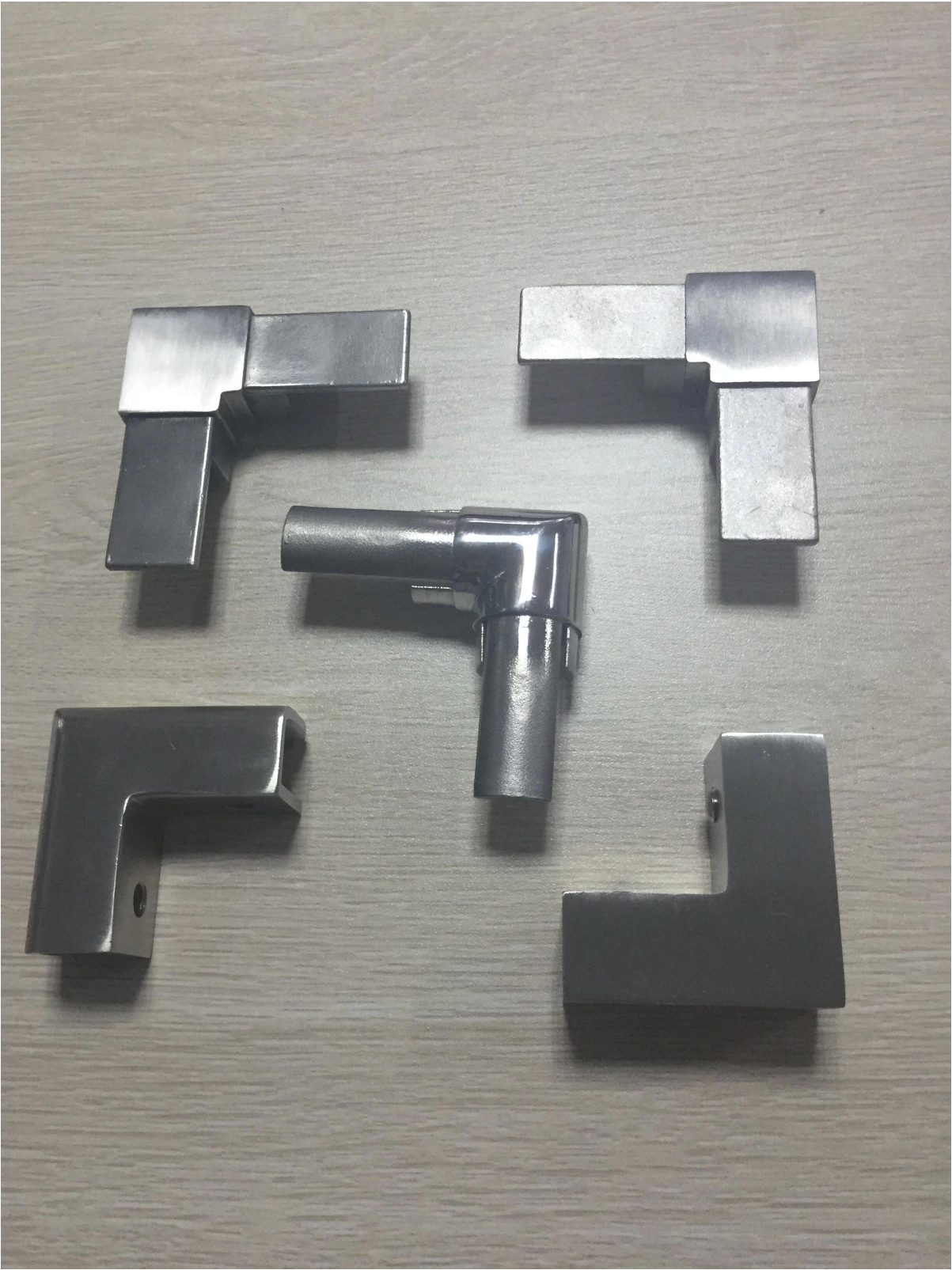
Project photo :