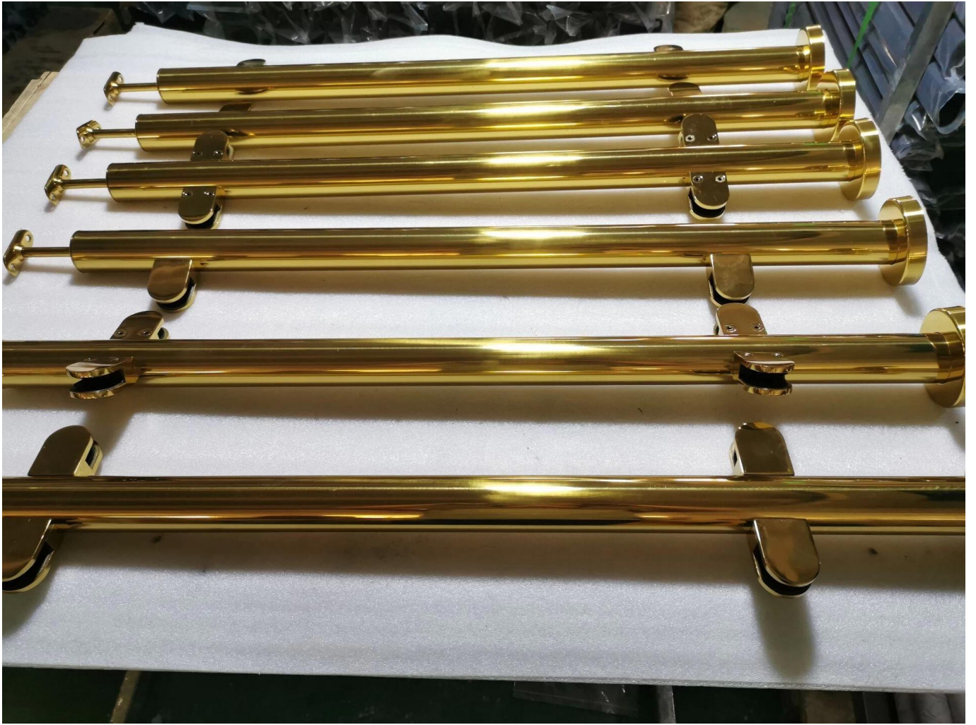
Round Handrail Tube: