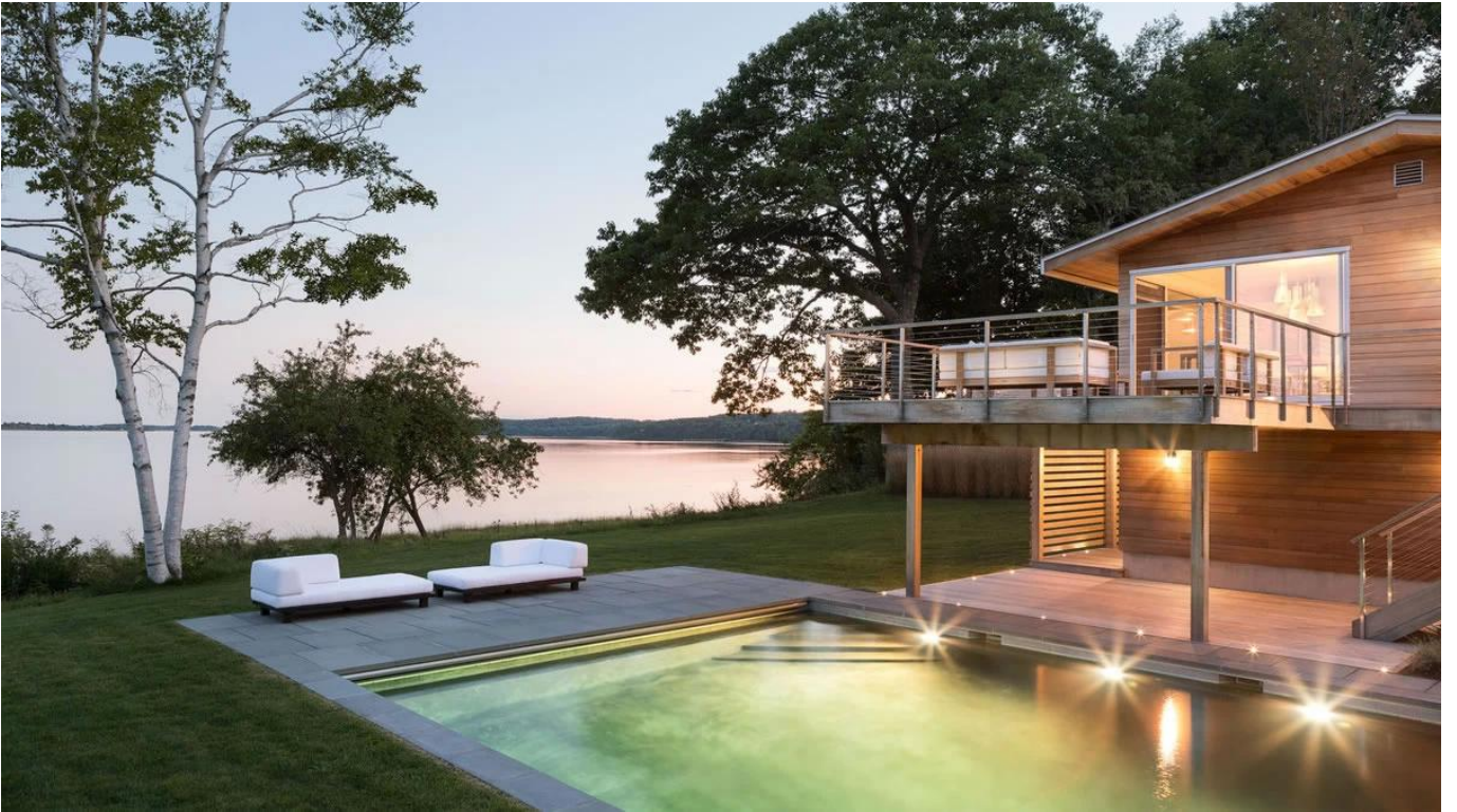
stainless steel cable railing system, internally threaded cable tension, wire rope railing for balcony and stair