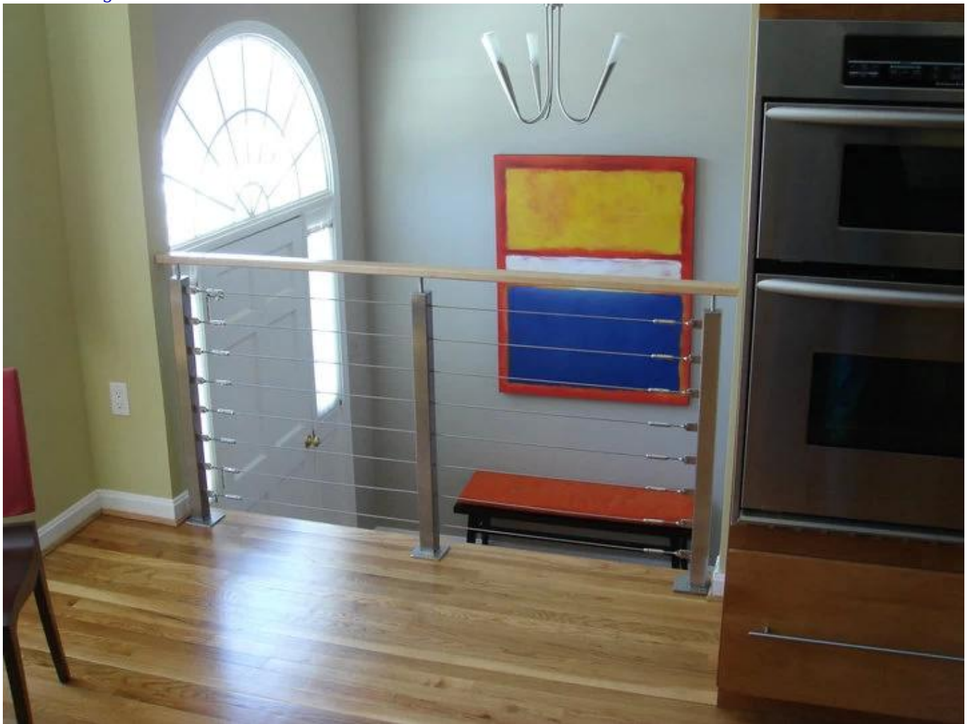
stainless steel cable end fittings,cable tensors ,wire rope tensioners 3mm,4mm,5mm wire rope end fittings,cable end fittings for the railing posts