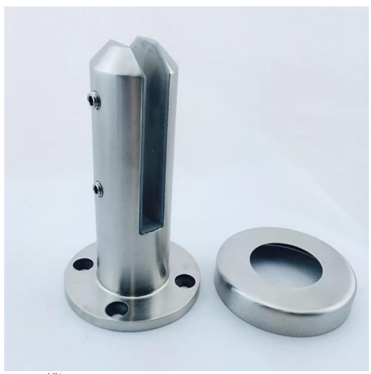
square core drill type :