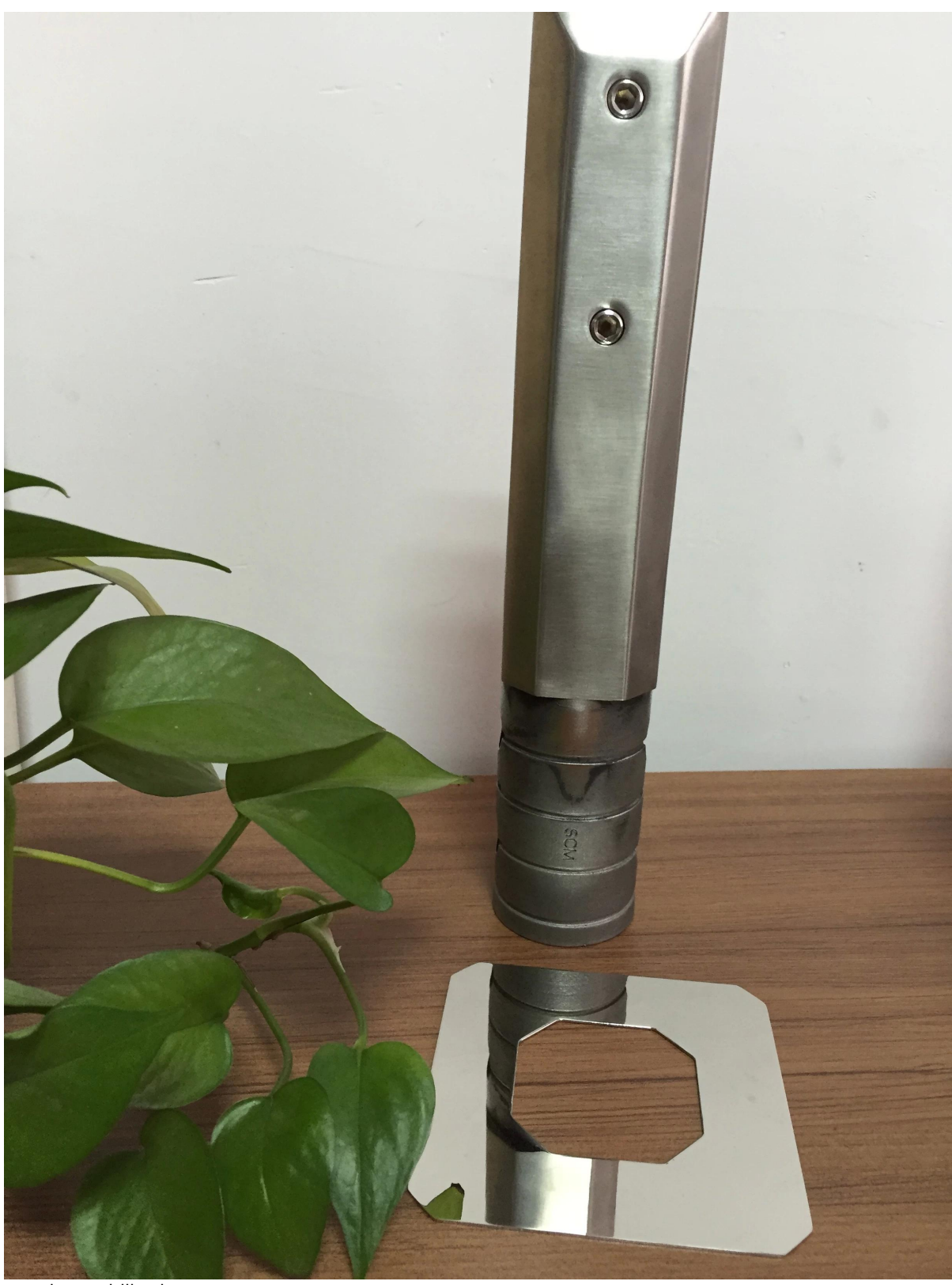
round core drill spigot