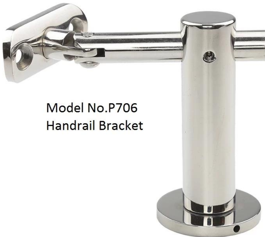
Model No.P706 Handrail Bracket

Drawing for wall handrail bracket , P706