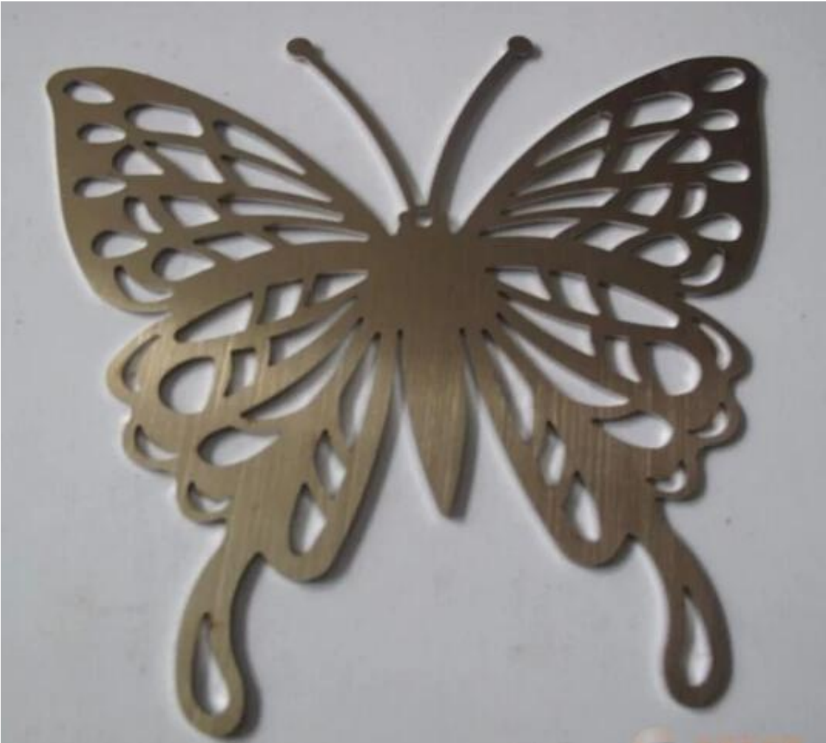
Factory and machining;