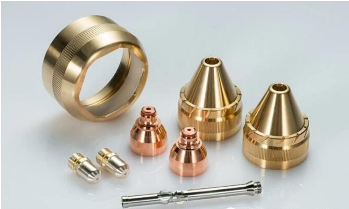
Surface treatment; powder coating, polishing, milling and so on;