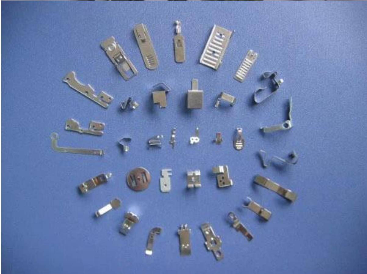
Sheet metal auto parts