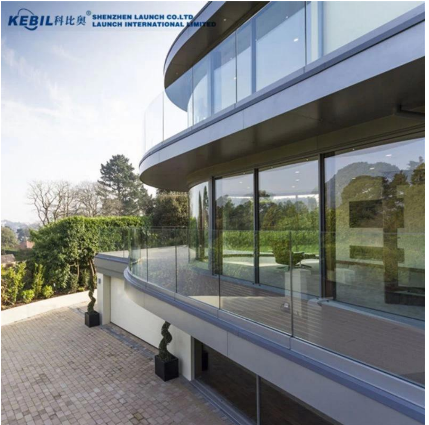
All U channel systems